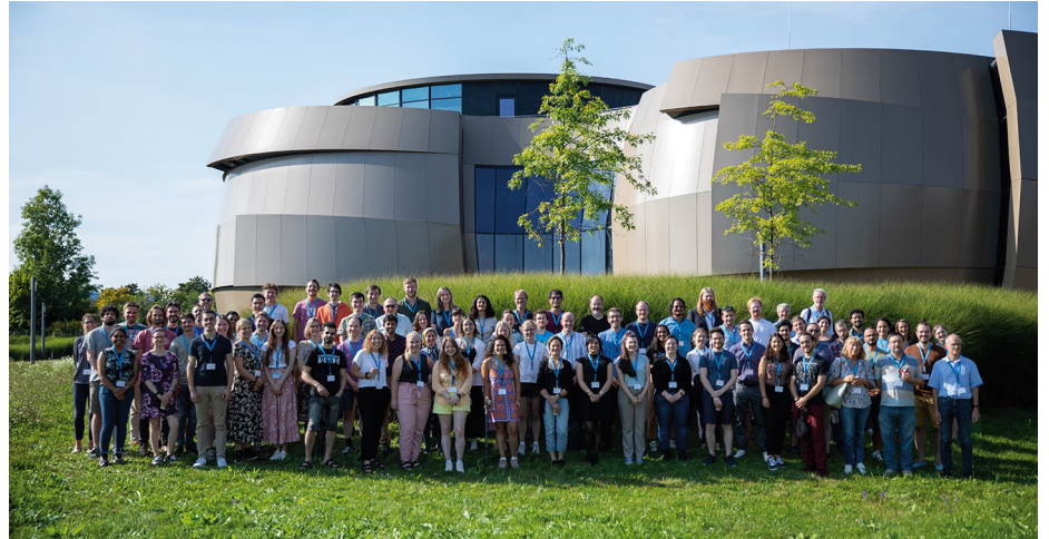
Figure 1. Conference photo in front of the ESO Supernova Planetarium & Visitor Centre.

Remarkably, star clusters also provide a unique window through which to study a multitude of phenomena linked to binary stars in a controlled environment, since the ages, metallicities, and masses of cluster members are usually well known. Given that, star clusters play a key role in improving our understanding of post-