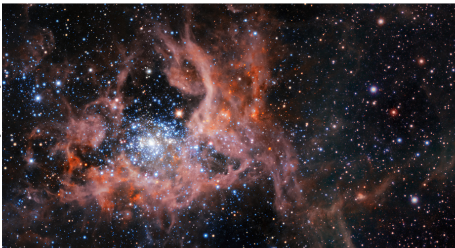
This infrared image shows the star-forming region 30 Doradus, also known as the Tarantula Nebula, highlighting its bright stars and light, pinkish clouds of hot gas. The image is a composite: it was captured by the HAWK-I instrument on ESO’s Very Large Telescope (VLT) and the Visible and Infrared Survey Telescope for Astronomy (VISTA).