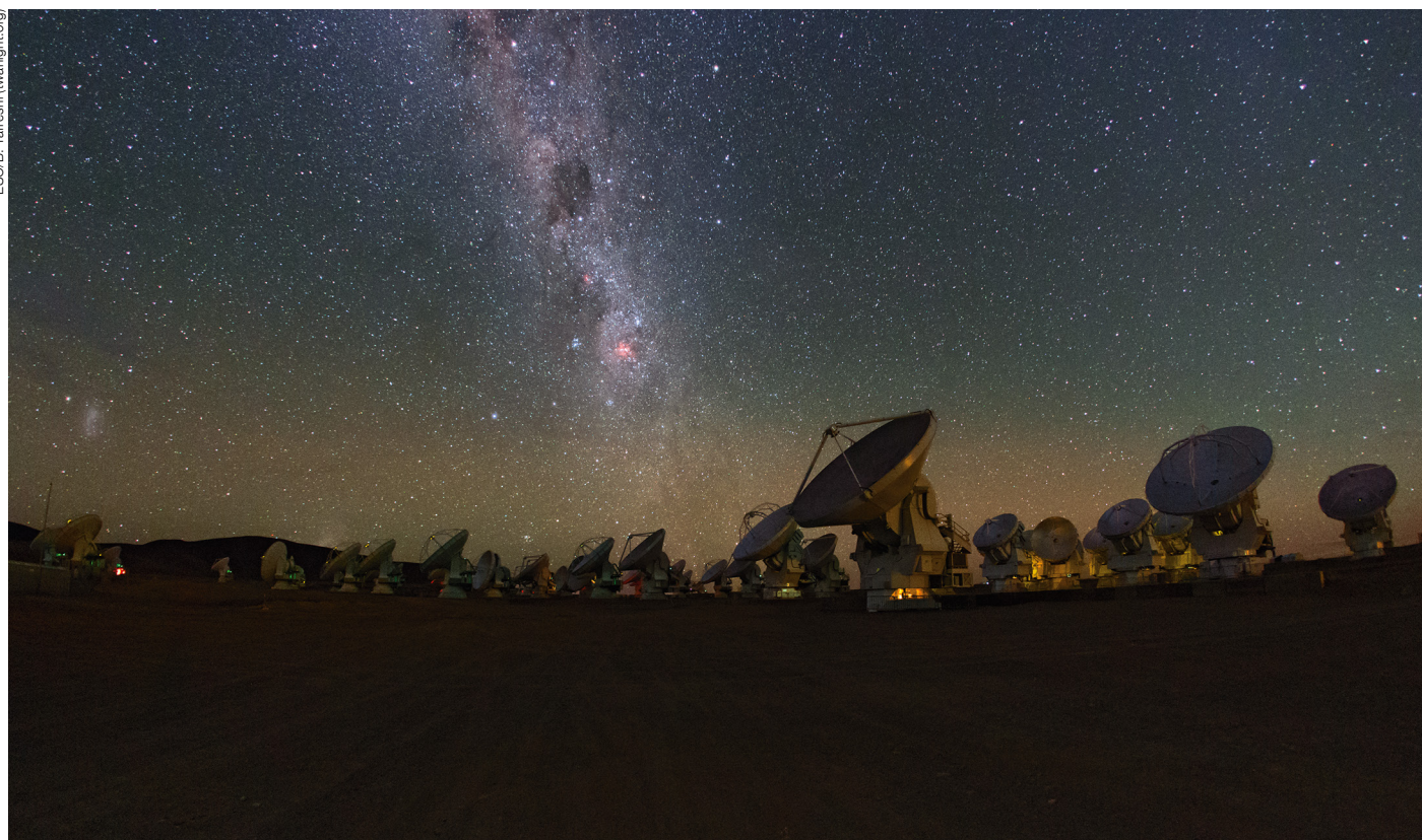
The Milky Way glitters above the ALMA array in this image taken from a time lapse sequence during the ESO Ultra HD Expedition.