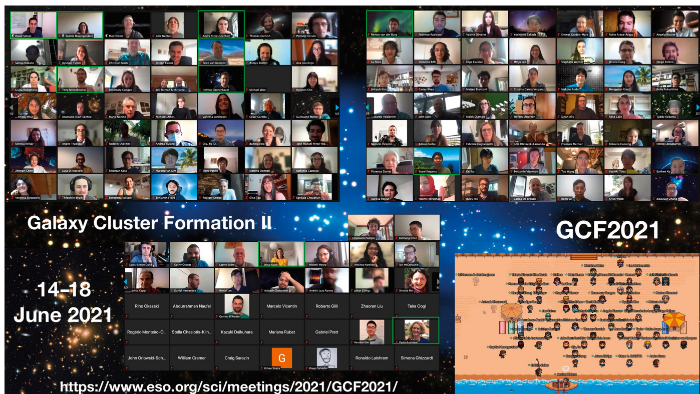
Figure 2. Conference photo montage produced by David Sobral using screenshots from Zoom and Gather.

The second component to the online interactions was through Gather, an online conference tool that participants