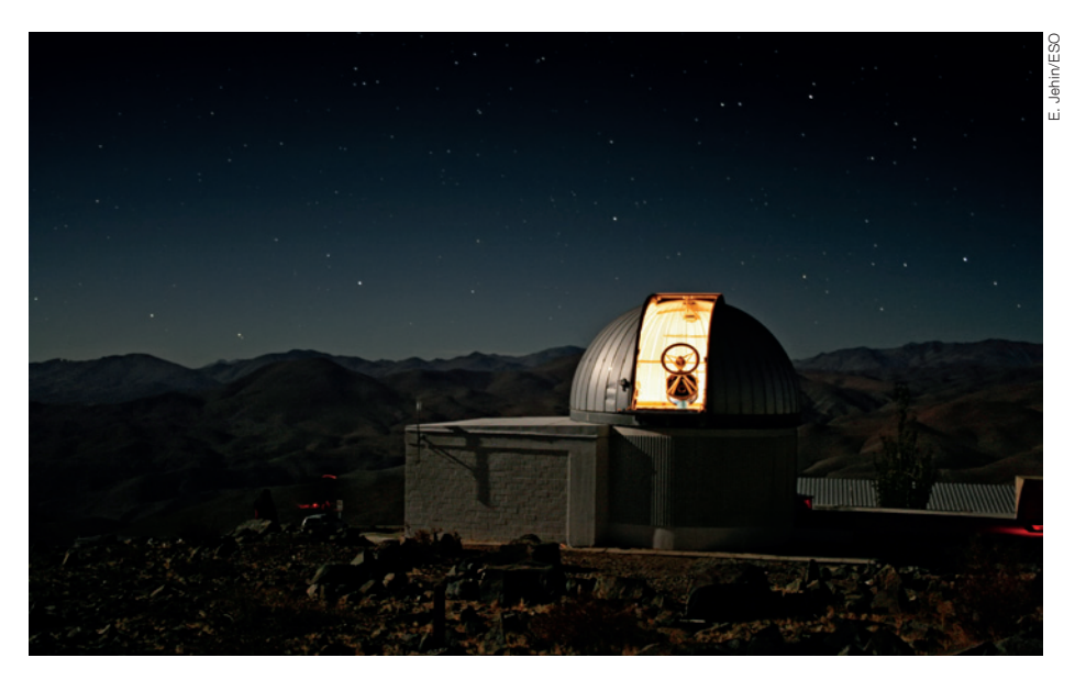
Figure 1. The TRAPPIST telescope in its 5-metre enclosure at the La Silla Observatory, Chile.

The hundreds of exoplanets known today allow us to place our own Solar System in the broad context of our own Galaxy. In particular, the subset of known exoplanets that transit their parent stars are key objects for our understanding of the formation, evolution and properties of planetary systems. The objects of the Solar System are, and will remain, exquisite guides for helping us understand the mechanisms of planetary formation and evolution. Comets, in particular, are most probably remnants of the initial population of planetesimals of the outer part of the protoplanetary disc. Therefore the study of their physical and chemical properties allows the conditions that prevailed during the formation of the four giant planets to be probed.