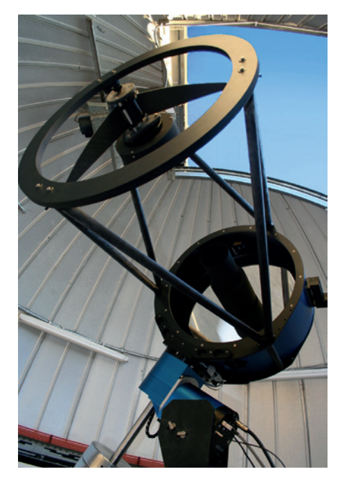
Figure 2. Close-up of the 60-cm TRAPPIST telescope.

allowed us to set up the experiment in less than two years.