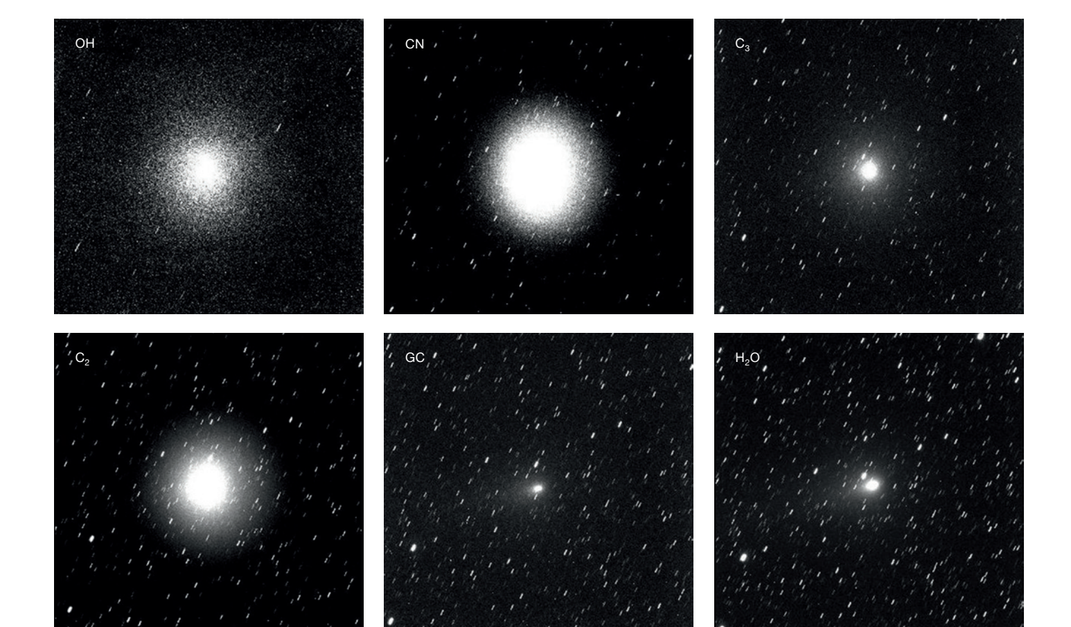
Figure 4. Comet 103P/Hartley 2 imaged with TRAPPIST through the different cometary filters on 5 November 2010: OH, CN, C<sub>3</sub>, C<sub>2</sub>, green continuum (GC) and H<sub>2</sub>O<sup>+</sup>. Note the different shapes and intensities of the cometary coma in each filter.

shop<sup>4</sup>, the huge amount of data collected by TRAPPIST will bring crucial new information on comets and will rapidly increase statistics, allowing comets to be classified on the basis of their chemical composition. Linking those chemical classes to dynamical types (for instance short period comets of the Jupiter family and new long period comets from the Oort Cloud) is a fundamental step in understanding the formation of comets and the Solar System.