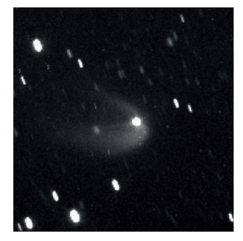
Figure 5. The TRAPPIST image of the the activated asteroid (596) Scheila taken on 18 December 2010.

through ten different filters. Our contribution to the worldwide campaign on this comet was recently published in Meech et al. (2011). The quality of the data allowed us to observe periodic variations in the gaseous flux of the different species from which we could determine the rotation of the nucleus and show that the rotation was slowing down by about one hour in 100 days (Jehin et al., 2010). This behaviour had never been so clearly observed before. The long-term monitoring of the production rates of the different species is nearly completed and will be combined with high-resolution spectroscopic data in the visible and infrared that we obtained at the ESO Very Large Telescope (VLT) to provide a clear picture of the chemical composition of this unusually active comet from the Jupiter family.