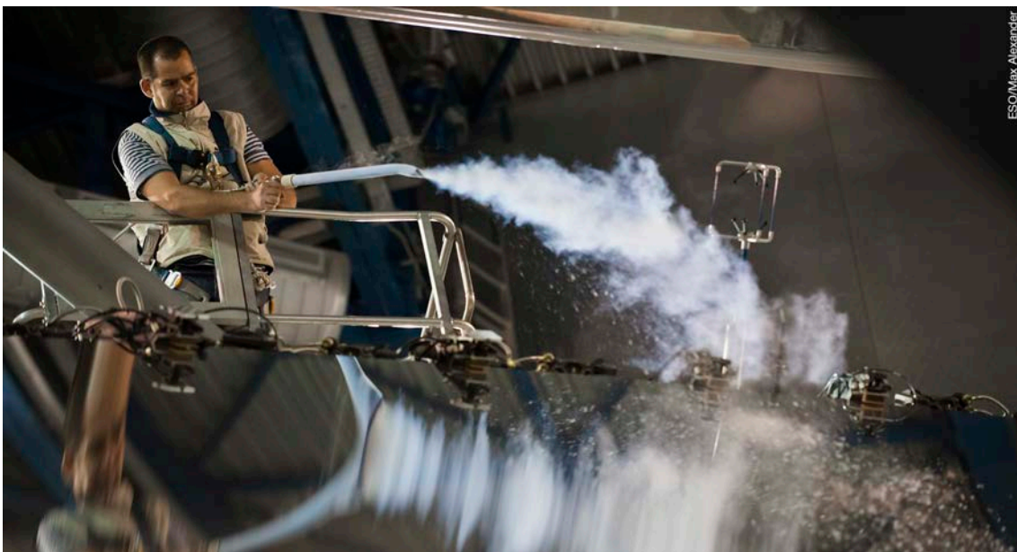
Cleaning mirrors with CO 2 .

Telescope and Instruments Operators (TIO) working full or partial night shifts receive an additional payment according to the duty station (expressed as a percentage of the basic salary). TIOs will also receive extra leave days as per table.