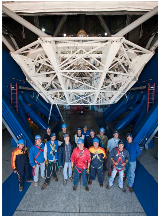
Group shot of engineers and maintenance staff at the VLT.

LSM appointed as an Emergency Coordinator at the observatories in the absence of the safety engineer during weekends or leave, are compensated under the same conditions as standby duty.