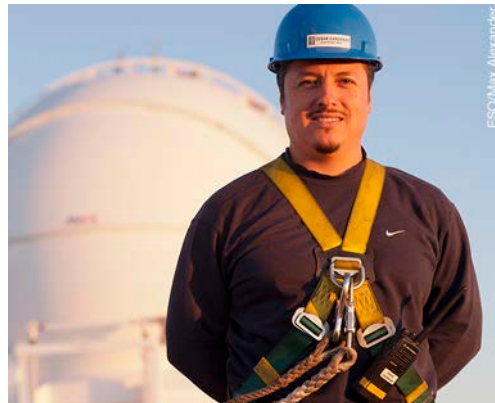
Electronic technician working on UTH/AOF.

LSM assigned to an observatory shall receive adequate working clothes and shoes, as recommended by the safety commission.