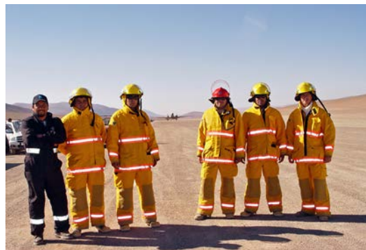
The Paranal Fire Brigade.