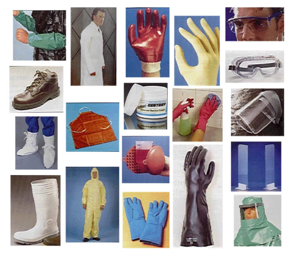
Figure 6. Examples of PPE