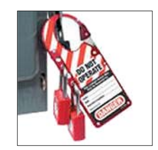
Figure 4. Examples of lockout hasps