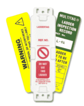
Figure 5. SCAFFTAG and Ladder-tag examples

Two-person-rule: The two-person-rule also applies.