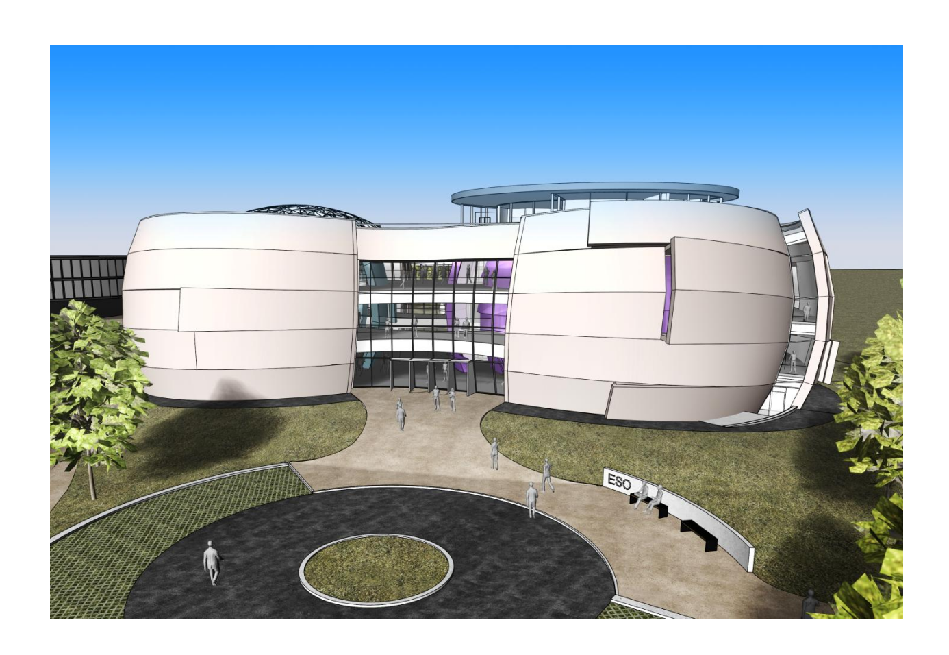
ESO Supernova — Planetarium & Visitor Centre

Europäische Organisation für astronomische Forschung in der südlichen Hemisphäre