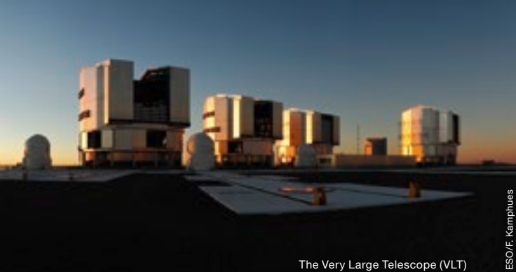
The Very Large Telescope (VLT)