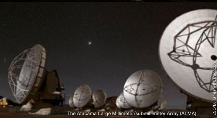
The Atacama Large Millimeter/submillimeter Array (ALMA)