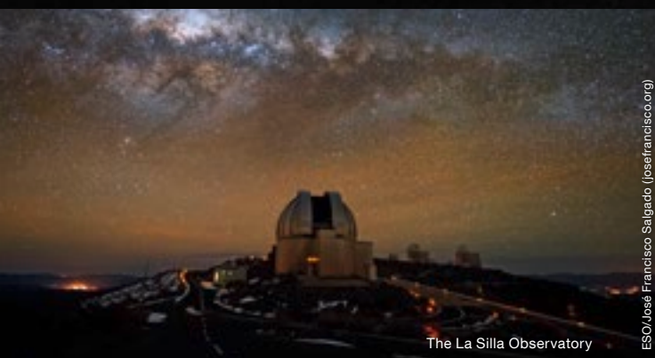
The La Silla Observatory