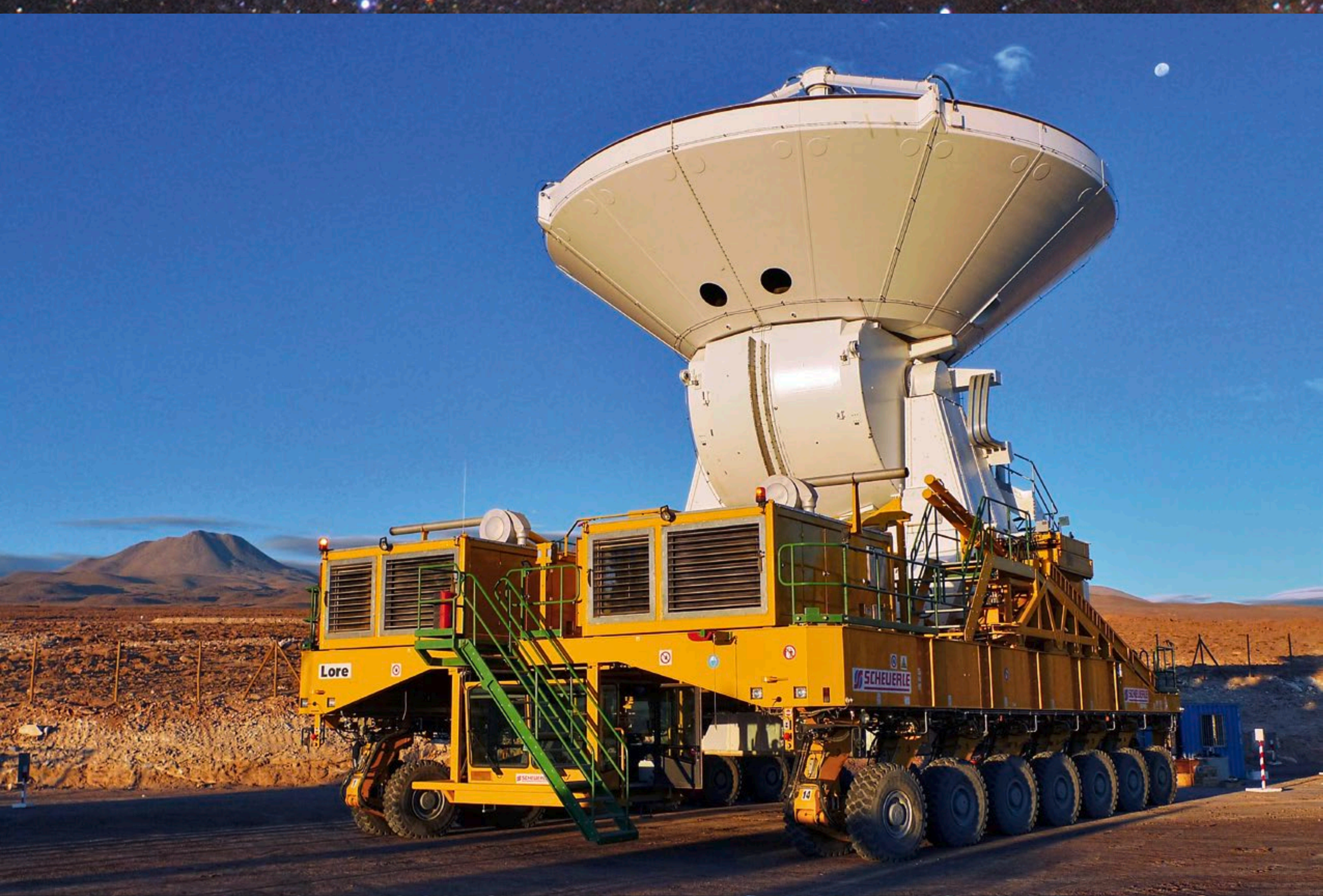
A European ALMA antenna takes a ride on one of the two enormous transporters.