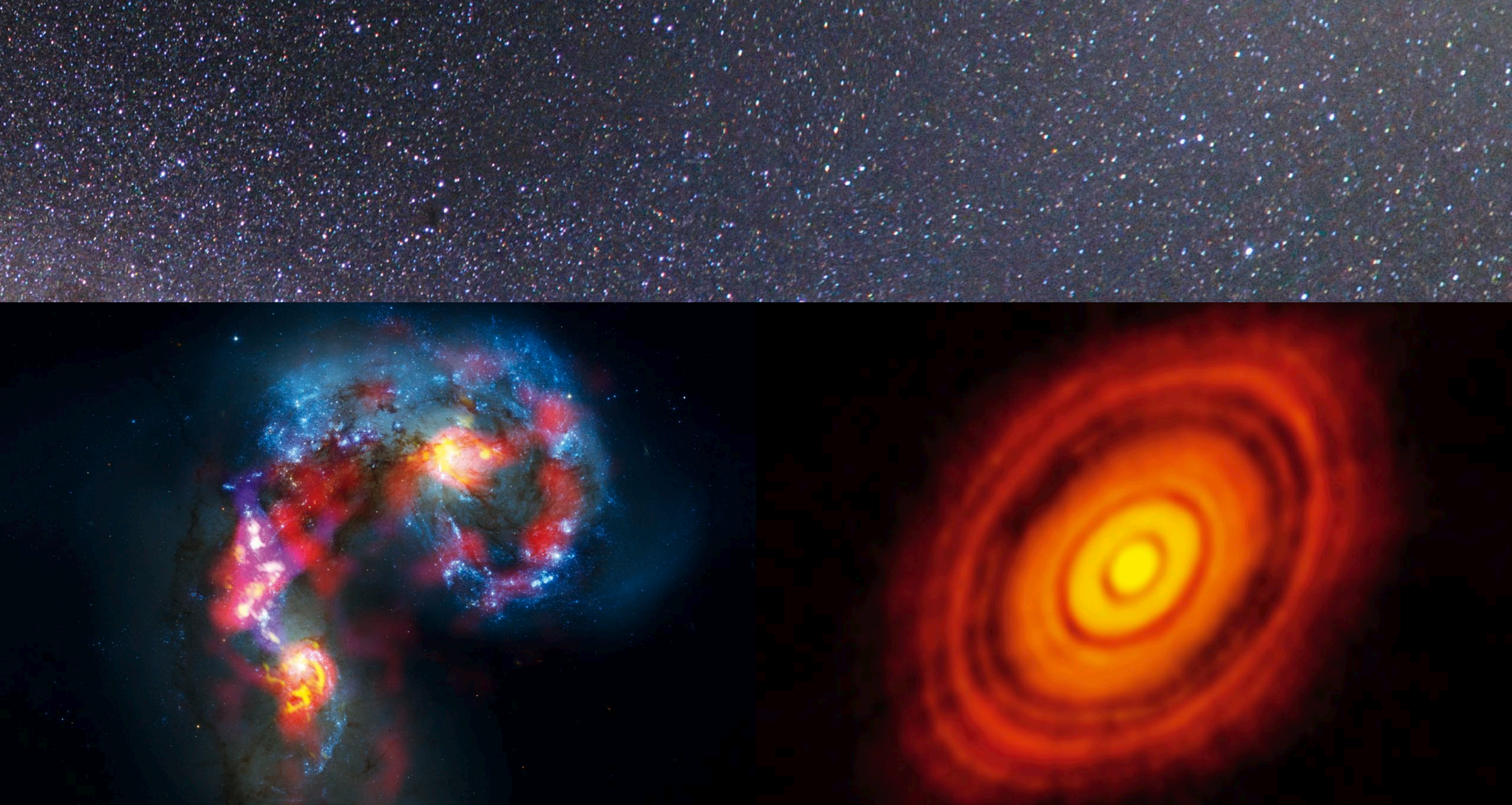
ALMA and Hubble observations of the Antennae Galaxies.