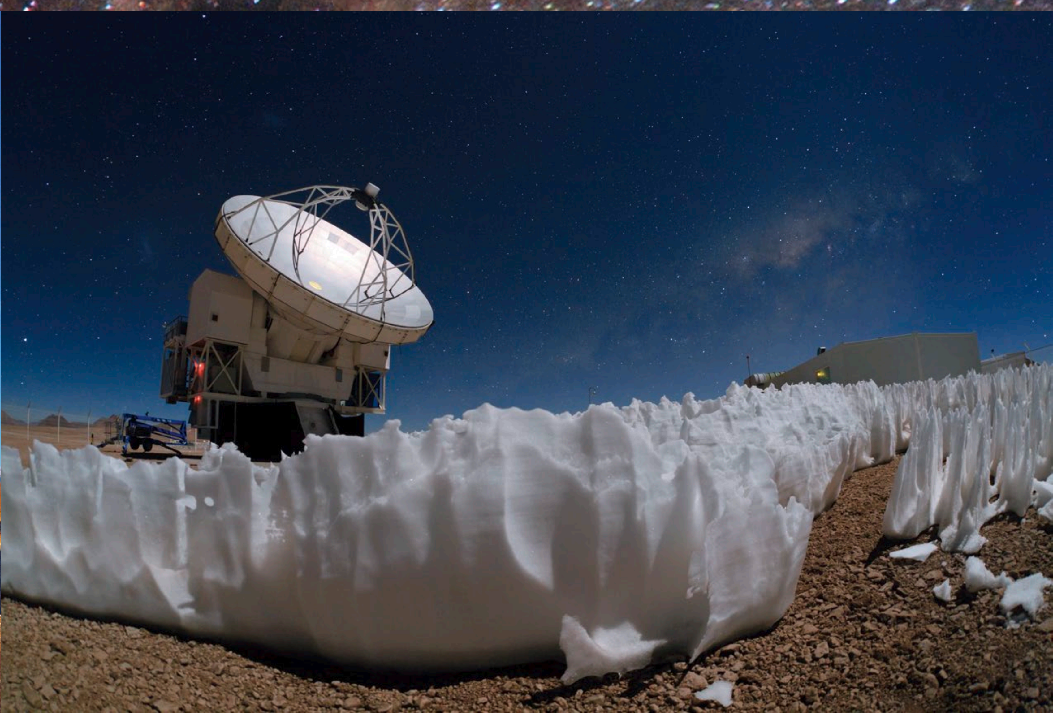
The APEX telescope is also located on the Chajnantor Plateau, close to ALMA.