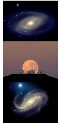
Spiral Galaxy NGC 613

The VLT has also detected the light of a cosmic fireball that took place when the Universe was a mere infant, only 7% of its current age, setting a new record for the discovery of the oldest and farthest explosion of a star yet seen.