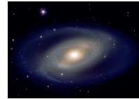
Spiral Galaxy NGC 1350

The annual member state contributions to ESO are approximately 120 million Euros, and ESO employs around 600 staff members.