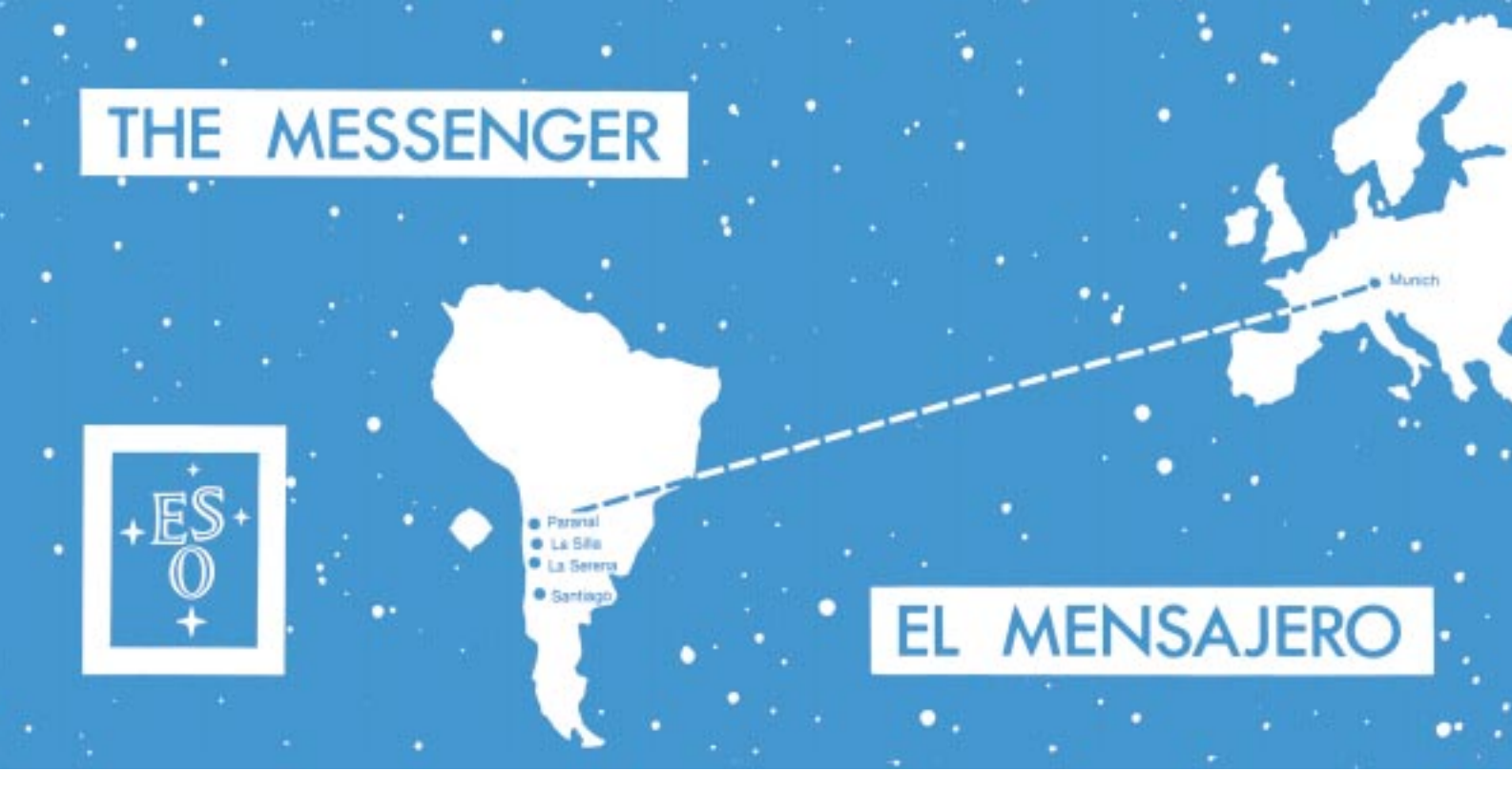
No. 96 - June 1999