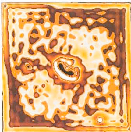
Figure 4: Wavelet transform of the PC image of NGC 4261 (level 4).