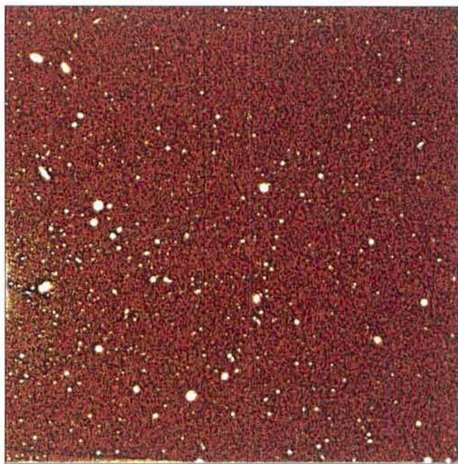
Figure 2: The image shown above results from subtracting a model of the galaxy light, which has been obtained by a median filtering technique. This is the frame on which we performed our search and photometry of globular cluster candidates. The crowding of stellar-like images near the galaxy centre is striking.