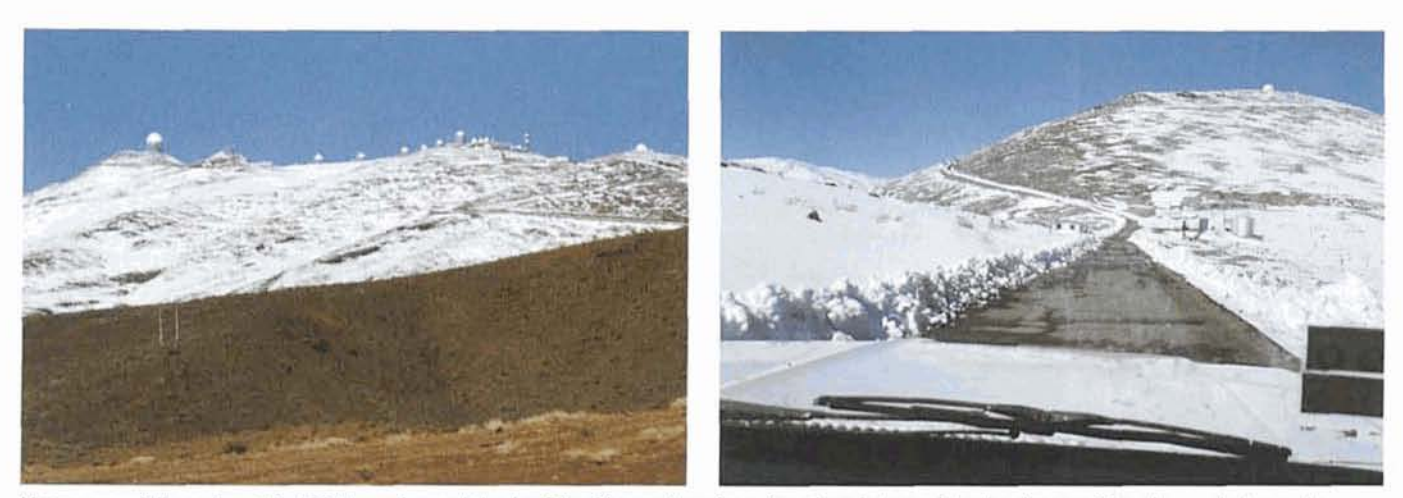
Heavy snowfall on June 18, 1991 transformed the La Silla Observatory for a few days into a winter landscape. The above photographs were taken on June 20 by Erich Schumann.