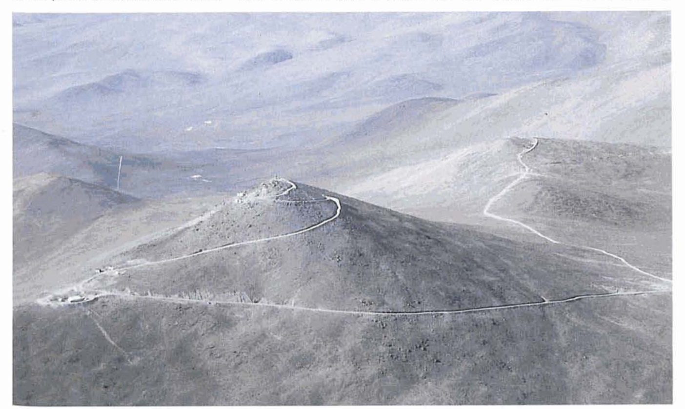
This aerial picture of Cerro Paranal was taken in late 1990 from the south. The Pacific coast is to the left, at a distance of 12 km. The constructions at the left are the living quarters for the site survey team, in place since 1983. On the top of the mountain various instruments are installed which permanently monitor the atmospheric quality and perform meteorological measurements.

For more than six years, continuous, accurate measurements have shown that Paranal is the best continental site known in the world for optical astronomical observations, both in terms of