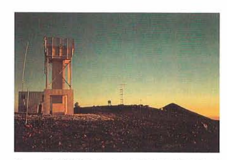
Figure 2: DIMM3 tower and control room on Cerro La Montura. The sharp summit of Paranal can be seen in the background.

A document "ESO VLT Instrumentation Plan: Preliminary Proposal and Call for Responses" will be distributed in June to Institute Directors, libraries and ESO Committee members. It presents a preliminary instrumentation plan for the VLT and outlines possibilities and requirements for the participation of ESO Member State Institutes in its implementation. Responses from the community are invited by November 1989, after which it is intended to finalize this plan and prepare the first Call for Instrument Proposals. A limited number of additional copies will be available from the Project Division (VLT Instrumentation Plan) at ESO.