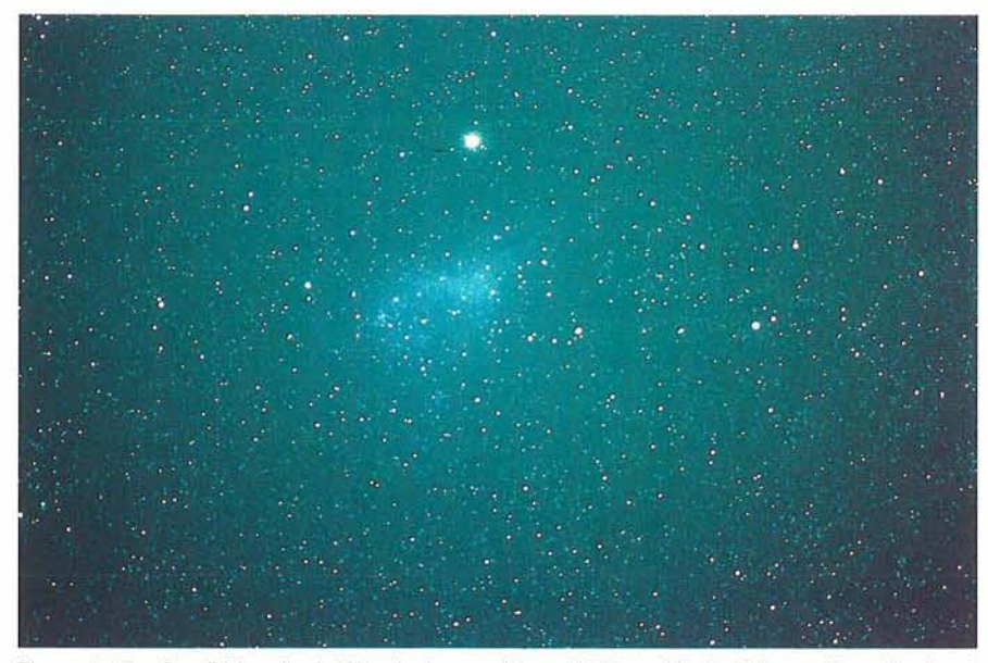
Figure 3: The Small Magellanic Cloud, observed from 5200 m altitude. Taken with a piggyback 135-mm f/2.8 lens during a 10-min exposure.

Our goal was multiple: first of all to try to determine whether the sky at very high altitude, visually spoken, is more beautiful and allows deeper limiting magnitudes than for instance the sky at La Silla. We were also interested in trying to profit from the natural "hypersensitization" conditions in the high altitude desert, that is the intense cold and virtually zero moisture content of the thin air. Finally we wanted to obtain sky photographs with our telescope, a Celestron 8; it is a veritable small, transportable observatory in which the electrical equatorial motion is fed by a battery which in turn is charged by solar cells. It also has a control system for the exposures and the guiding, interference filters, etc.