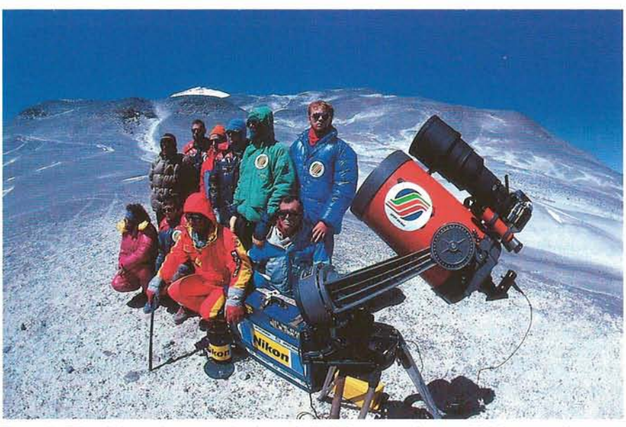
Figure 2: "The highest observatory in the world". At the second camp, 5200 metres above sea level, all members of the team gather proudly behind the telescope.