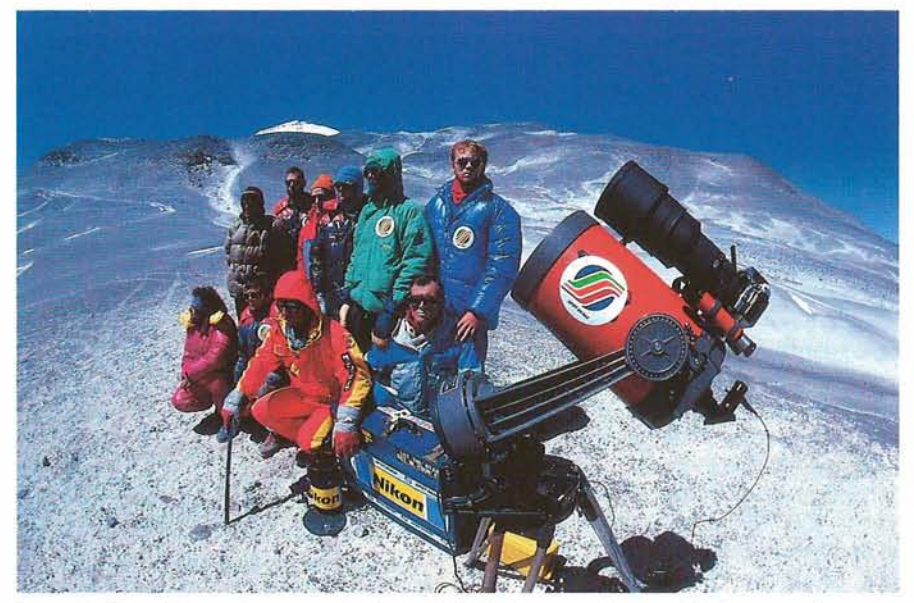
Figure 2: "The highest observatory in the world". At the second camp, 5200 metres above sea level, all members of the team gather proudly behind the telescope.