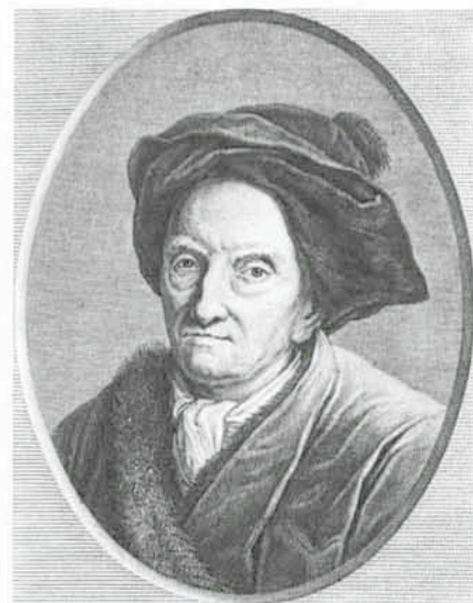
Figure 2: Portrait of Fontenelle from the luxury edition in 1796.

The Introduction is directed to Monsieur de L***, and Fontenelle tells about some pleasant days spent in the country house of Madame La Marquise G***. Surely L***, who expects to hear about parties, hunting and card games, must be surprised to read about "planets, worlds and vortices; the talk was almost only about such things". And here commences the narrative about how Fontenelle (the "I" in the book) and Madame La Marquise G*** spent five evenings in