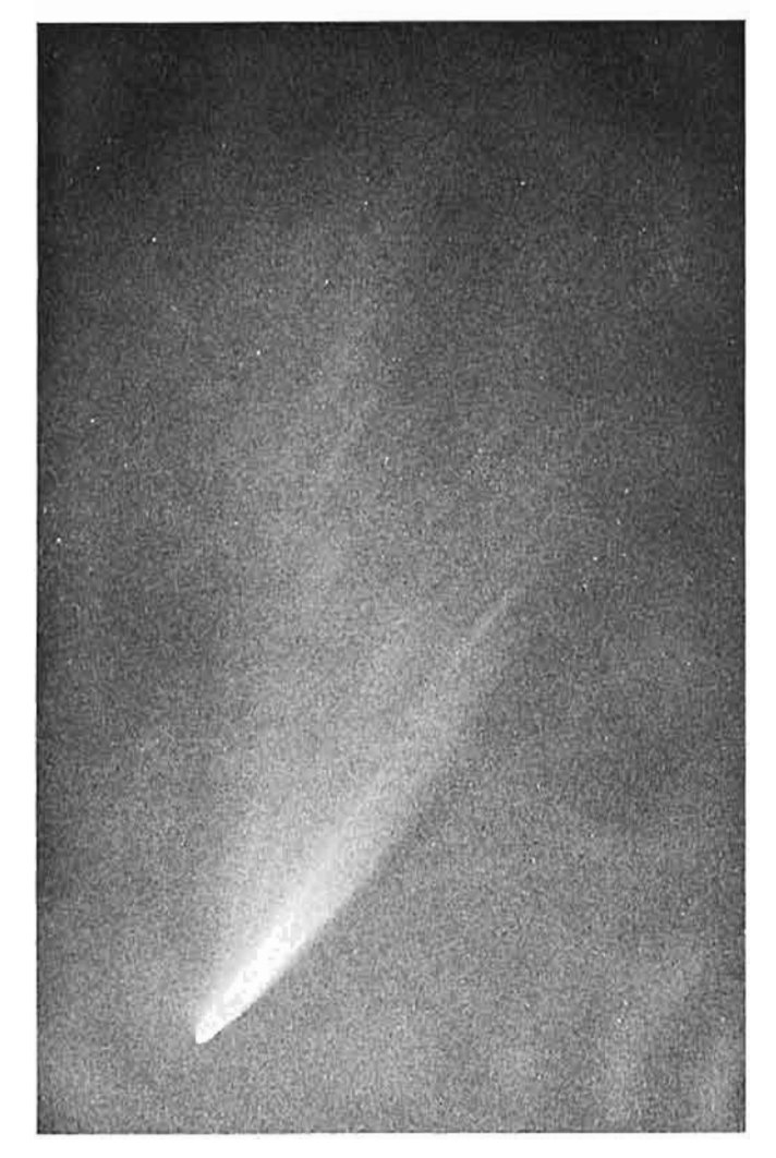
Comet West on March 4, 1976, 10 min. exposure by C. Pallard (CERN) and B. Pillet (ESO) from Col de la Faucille, near Geneva.

record, 1,030 million kilometres. The perihetion passage took place already in January 1975, but no plates appear to have been taken early 1975 in the corresponding direction.