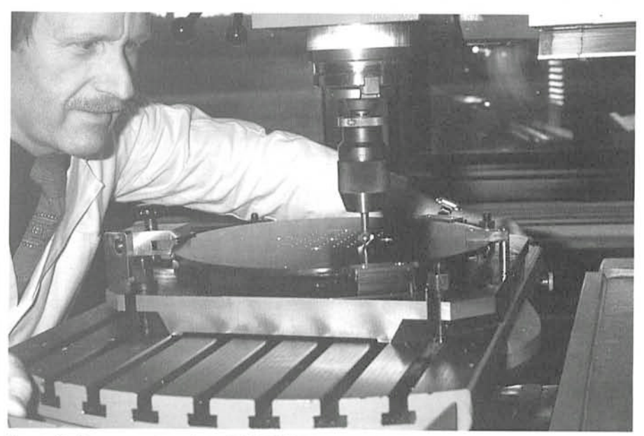
Figure 2: Close-up view of an OPTOPUS "starplate" being machined at the workshop in Garching. The programmable milling machine is ideal for this type of work requiring frequently repeated machining sequences.