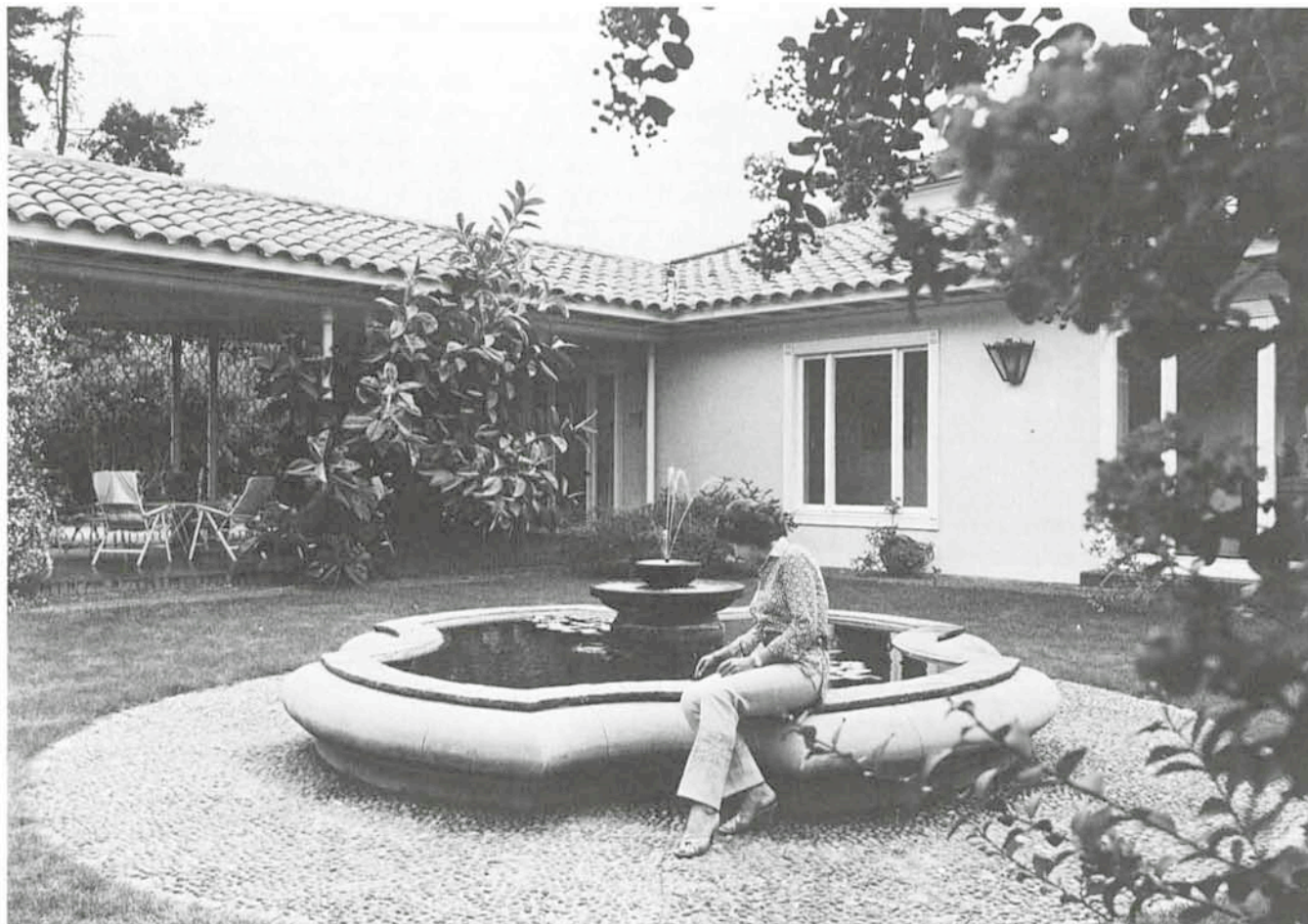
The ESO guesthouse in Santiago where the visiting astronomers are happy to rest for one day after more than 20 hours in a plane.

Strangely enough, the first problem comes about because the Universe looks so isotropic. Observations of galaxies and extragalactic radio sources (radio galaxies and quasars) show that the distribution of condensed matter in space, aside from local irregularities, is isotropic to better than one part in a hundred. But a much stricter limit is derived from the observations of the 3°K universal radiation which, as reported by D. T. Wilkinson (Princeton), appears to be intrinsically isotropic on all angular scales to better than one part in ten thousand. However, in the framework of the standard "hot big-bang" model it can be shown that two hypothetical observers placed, say, 180° apart in the sky at a distance corresponding to the last moment in which the universal radiation interacted with ordinary matter, could not have communicated with each other. Technically speaking, this is equivalent to saying that the "horizons" of the two observers, whose radii increase with the speed of light (the maximum possible speed), were still well separated. Now the isotropy problem arises because it is difficult to see how regions of space which had no time from