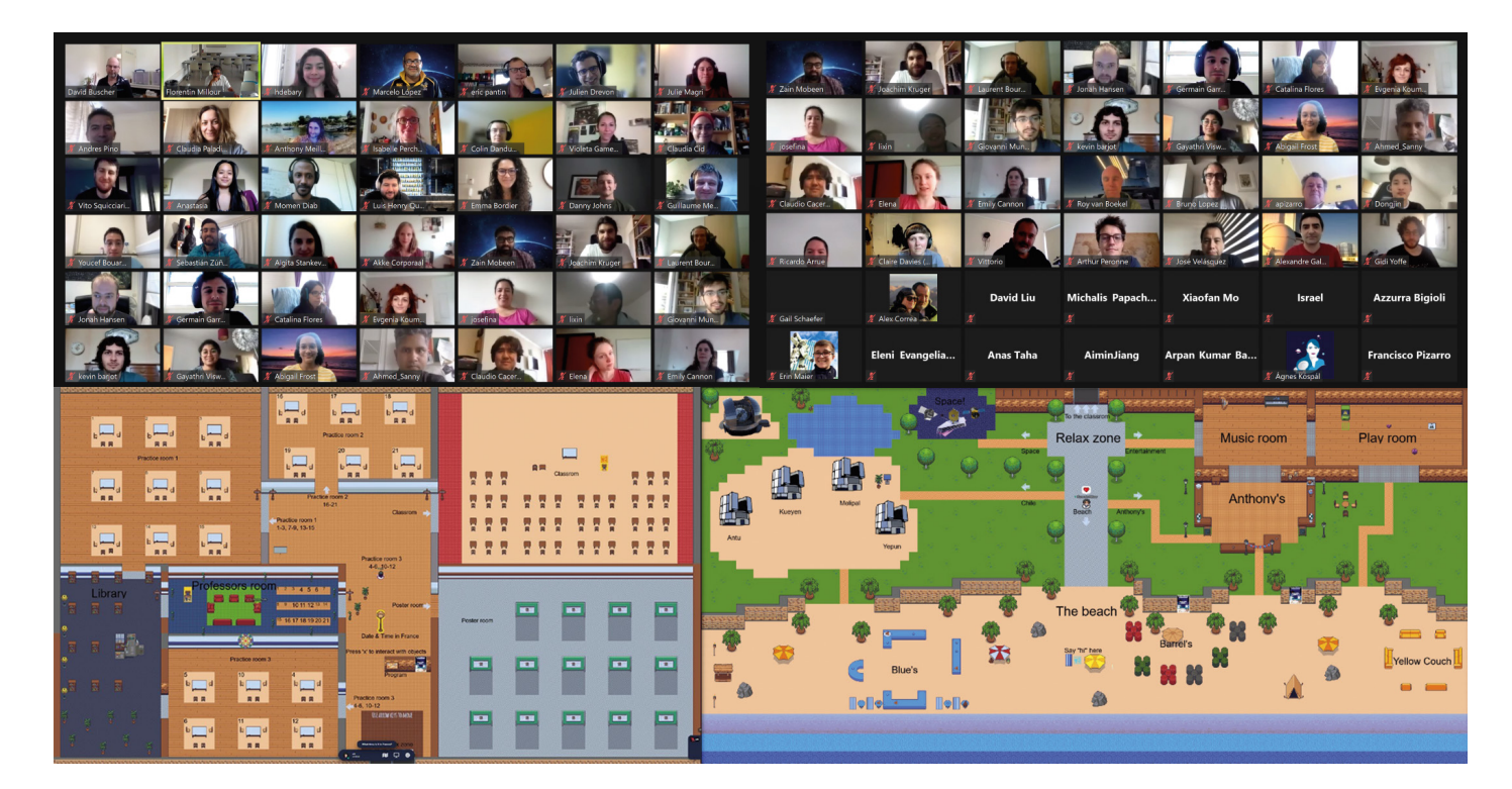
Figure 1. (Above) Top row: The Zoom school picture (featuring 67 of the participants). Bottom row: The Gather school places: on the left are the workspace with a classroom, rooms for the practice sessions with shared whiteboards, a library (collection of links to useful resources), and a poster room; on the right is the relax zone with many split rooms used for informal or group discussions.

Figure 2. (Below) Registered participants' countries. We note the presence of students and free listeners from developing countries (Peru, Iraq, Iran, Egypt etc.), who were able to access the school thanks to its 100% online nature. Finally, we note a newcomer to the field of optical interferometry, China, that may be a sign of exciting new developments!