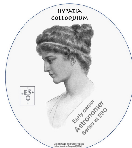
Figure 1. Logo of the ESO Hypatia Colloquium series.

The complete programme of the talks can be found on the dedicated web page 1 . The programme page reports the name and a photo of each speaker, together with the title of the talk and the date and time of each event. By clicking on the title of the talk it is also possible to download the full abstract of the talk and a Curriculum Vitae of the speaker. We show in Figure 2 the distribution of gender and year of PhD of the speakers selected for the Hypatia Colloquium 2021. It is worth noting that the call was released in November 2020 and the programme published at the end of the