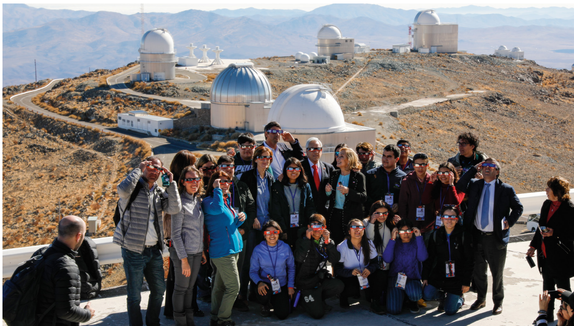
Figure 2. The President of the Republic of Chile, Sebastián Piñera, pictured with Chilean high school students while visiting La Silla.