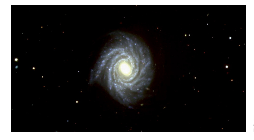
Image from first light FORS BVRI observations of the spiral galaxy NGC 1288 on the night of 15 September 1998.