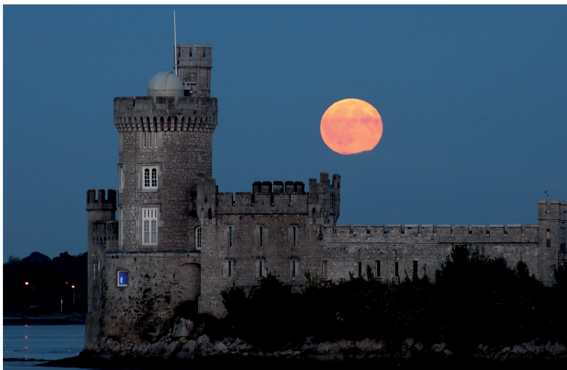
Figure 6. Blackrock Observatory in County Cork. This is largely used as an outreach facility to promote astronomy to a broad audience.