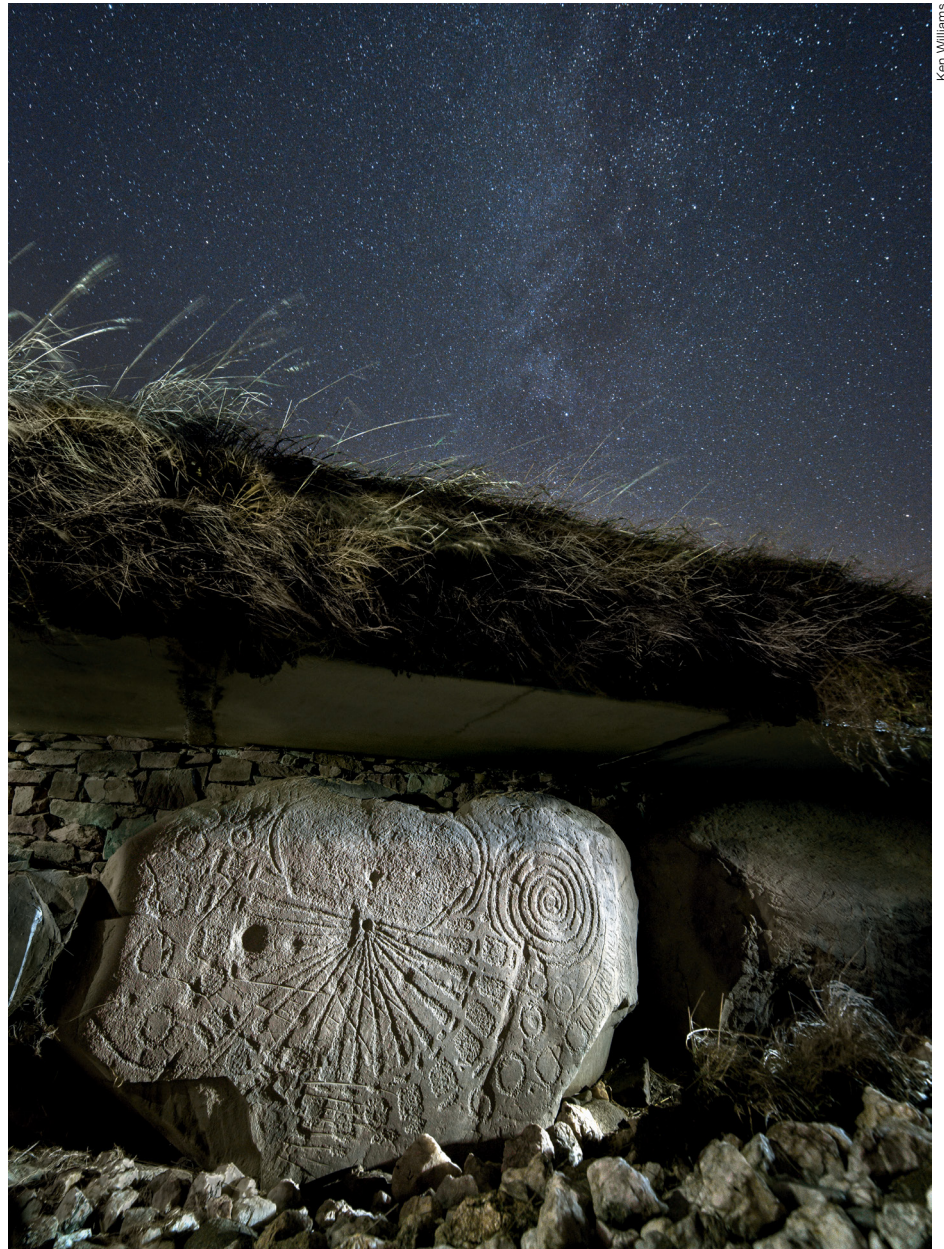
Figure 1. The so-called Sundial Stone decorates one of the mounds at Knowth in the Boyne Valley and dates back 5000 years. Interpreting such art is notoriously difficult but there is little doubt that nearby Newgrange was deliberately aligned with sunrise on the winter solstice.

Interest in astronomy in Ireland can be traced back over 5000 years. The pre-Celtic inhabitants built magnificent structures such as those in the Boyne Valley northwest of Dublin long before the pyramids — and even Stonehenge — were constructed. One in particular, at Newgrange, is renowned for marking the winter solstice sunrise. For a few days either side of the shortest day of the year, light from the rising Sun shines through the roofbox above its entrance, traverses a 20-metre long passage, and illuminates the main chamber inside the giant mound. The precision achieved is remarkable when one considers that the alignment is