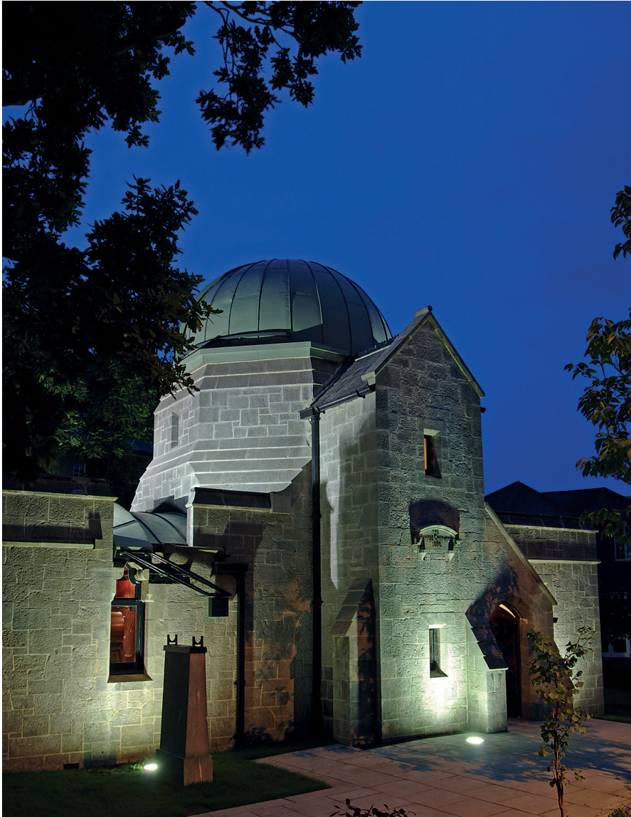
Figure 5. Crawford Observatory, University College Cork.

be a vibrant research area, with about 20 staff, researchers and postgraduate students. UCD astronomers are leading research on a wide range of topics, including the search for and characterisation of galactic and extragalactic very high-energy gamma-ray sources with the VERITAS telescope array, the Cherenkov Telescope Array (CTA), astrophysical jets with the LOw-Frequency-Array (LOFAR), pulsar timing, shock acceleration theory, gamma-ray bursts and other transients detected by