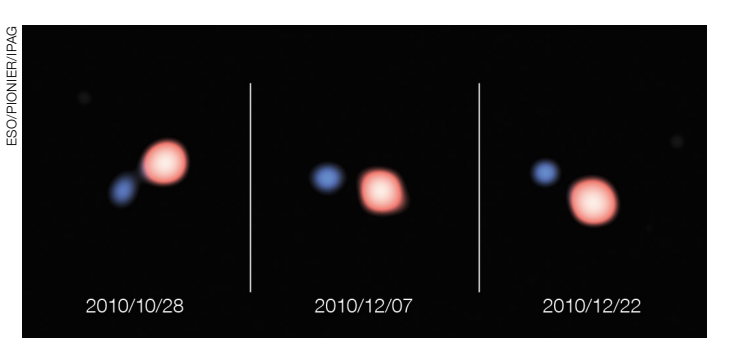
Figure 1. Image reconstruction of the PIONIER observations of SS Lep showing the orbital motion of the resolved M giant and the A star. The images are centred on the centre of mass. The distortion of the giant in the images is most certainly an artefact of the asymmetric point spread function. See Release eso1148 for more details.

The M giant is found to have a mass of 1.3 M_{\odot} , while the less evolved A star has a mass twice as large: thus a clear mass reversal must have taken place, with more than 0.7 M_{\odot} having been transferred from one star to the other. Our results also indicate that the M giant only fills around 85 +/- 3% of its Roche lobe, which means that the mass transfer in this system is most likely by a wind and not by RLOF. However, as the M giant is currently thought to be in the early-AGB phase where mass loss is still very small, it is difficult to understand how the star could have lost so much mass in a few million years (the time spent on the AGB until now), unless one invokes the companion-reinforced attrition process of Tout & Eggleton (1988), i.e. assuming that the tidal force of the companion dramatically increases the wind mass loss. Although this process allows, in principle, the current state of SS Lep to be explained without resorting to a Roche lobe overflow, the validity of this assumption still needs to be proved by a more detailed study.