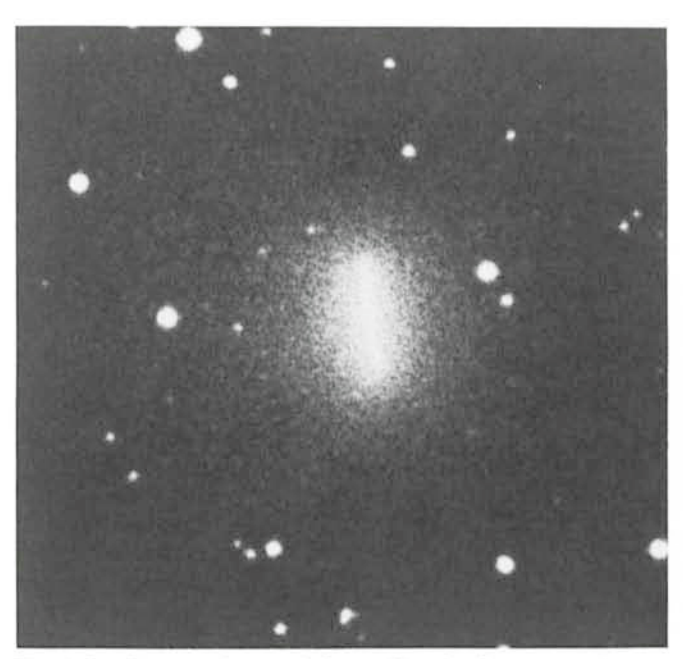
Fig. 1: Prediscovery image of Comet Haneda-Campos on August 9, 1978. ESO 1 m Schmidt telescope. IIa-O \pm GG 385, 60 min. Magnitude about 12.

It started on September 1, when J. da Silva Campos in South Africa and T. Haneda in Japan independently discovered the same comet, now named Haneda-Campos (1978 j). The comet moves in an elliptical orbit with a period of only 6 years, possibly because it came near Jupiter in 1957 and 1969 and was "captured". Searching the plate archives in Pasadena and Geneva brought to light two prediscovery images of 1978 j from early August, the first with the Palomar 46 cm Schmidt telescope, the second with the ESO Schmidt (see the photo). Blame to the professionals!