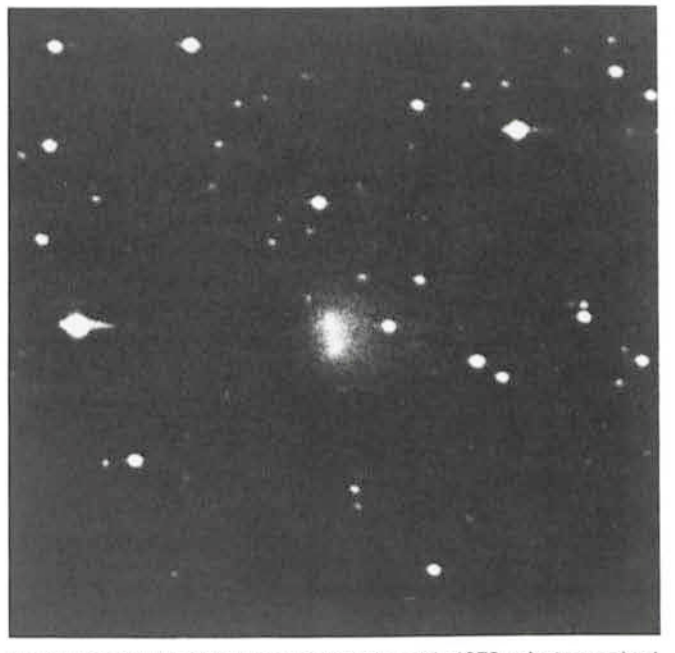
Fig. 3: Comet Machholz on September 14, 1978, photographed with the ESO Schmidt telescope on a 098-04 (red) plate behind a RG 630 filter. Exposure time 10 min in moonlight. Observer: H.-E. Schuster. The horizontal "bars" connected to the brighter stars were caused by a shutter failure.