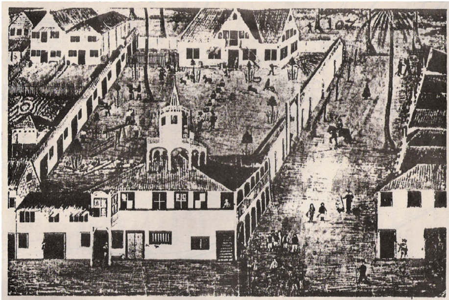
Figure 1. A contemporary engraving by Zacharias Wagener of a building in 17th century Recife that may have hosted the first astronomical observatory in the Americas.

However, troubled times and warfare between the countries disputing hegemony over the rich Brazilian colonies impeded the long-term survival of these initial astronomical activities and astronomy only took firm root in Brazilian soil after the country became an independent empire in 1822. On 15 October 1827, the Emperor Dom Pedro I established the institution that has now evolved into the Observatório Nacional (ON) in Rio de