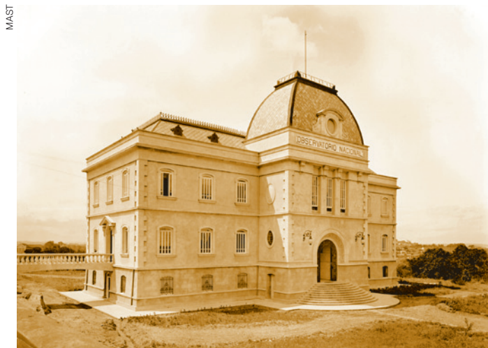
Figure 2. The early home of the Observatório Nacional in Rio de Janeiro, photographed in 1921, which today hosts the Museum of Astronomy and Related Sciences.

Astronomy began to establish itself in other Brazilian institutions in the late 19th century and this progressed, primarily in the universities, and most notably in São Paulo and in Porto Alegre, at a rather modest pace during much of the 20th century. Astronomy in Brazil has only really taken off during the past three or four decades. The three main factors that have contributed to this substantial and very successful increase are: