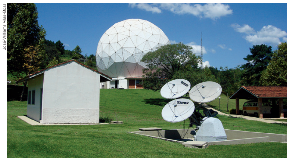
Figure 5. The dome of the Itapeninga Radio Observatory (RO) in Atibaia, São Paulo.

The growing importance of large surveys and the exploitation of data banks for astronomical research has been recognised and has led to the recent creation of the Brazilian Virtual Observatory (BraVO), as the national branch of the International Virtual Observatory Alliance. BraVO unites researchers from various institutions in a coordinated effort to create infrastructure and tools for data-mining and to disseminate the concept of the Virtual Observatory in Brazil. In parallel, the LineA (Laboratório Interinstitucional de e-Astronomia) collaboration is formed by scientists working at three research institutes of the Ministry of Science and Technology (MCT) to develop the infrastructure and software to store and process large astronomical datasets.