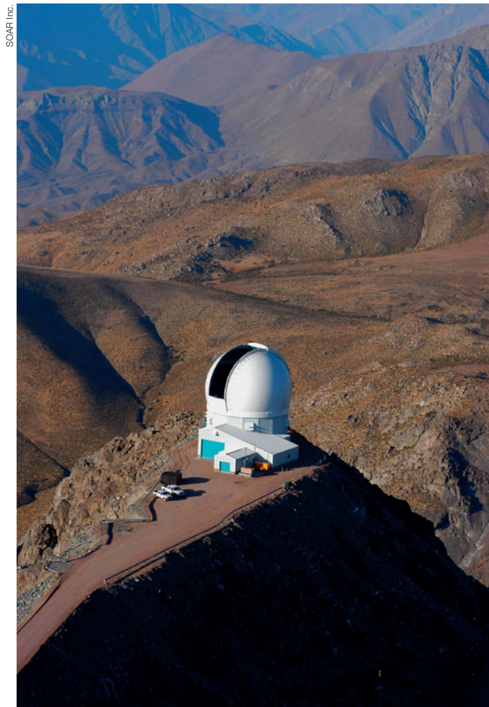
Figure 4. The 4.1-metre SOAR Telescope on Cerro Pachón, Chile.

highly productive wide-field 4-metre-class telescope with competitive instruments in the northern hemisphere. The agreement is limited in time and will be reviewed, with the aim of potentially renewing the contract, in 2012.