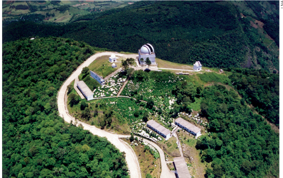
Figure 3. Aerial view of the OPD, the principal observatory on Brazilian territory, located in the Serra da Mantiqueira in the southern part of the State of Minas Gerais, operating a 1.6-metre telescope (main building) and two 0.6-metre telescopes.

Brazilian observational optical astronomy takes place primarily at the OPD (shown in Figure 3). When the observatory was planned in the 1970s, logistical considerations demanded that the observatory was built within easy reach of the big population centres where most astronomers were located. A site within the tri-