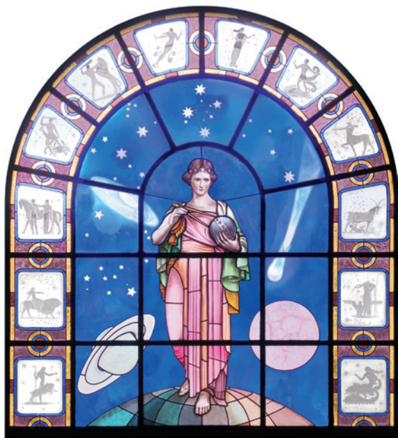
Figure 7. Urania, the Muse of Astronomy, from a picture window in the library on the former campus of the Institute of Astronomy and Geophysics of São Paulo University.

as many as the second most important, the venerable Observatório Nacional in Rio de Janeiro. Strong astronomy groups can also be found at INPE, located in São José dos Campos, the Federal University of Rio de Janeiro (distributed between the Observatório do Valongo and the Department of Physics), the Federal University of Rio Grande do Sul in Porto Alegre and the Federal University of Rio Grande do Norte in Natal. While all these astronomy centres carry out research in many fields, the Brazilian Centre of Physical Research (Centro Brasileiro de Pesquisas Físicas [CBPF]), Rio de Janeiro, which hosts the Brazilian branch of ICRA-net, focuses mainly on cosmology.