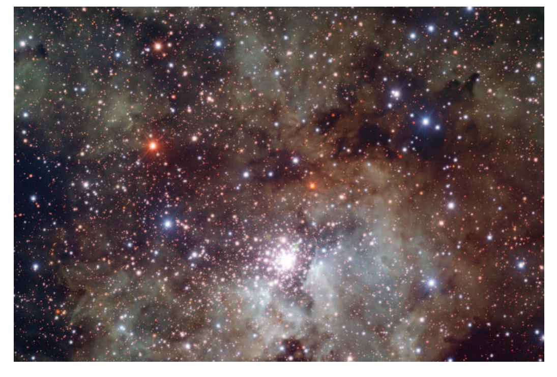
A recent FORS image showing the massive young Galactic star cluster NGC 3603. Located at about 8 kpc, NGC 3603 is the nearest giant H<sub>II</sub> region. This colour image (7 × 7 arc-minutes) was formed from FORS2 exposures taken through V , R and I filters. See release eso1005 for more details.

For technical details on FORS see http://www.eso. org/sci/facilities/paranal/instruments/fors/.