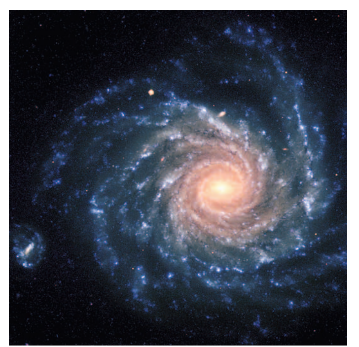
Figure 3. Named one of the most inspiring astronomical images of the 20th century: the FORS1 first light image of the galaxy NGC 1232.

It turned out that the instrument was in optimum focus when mounted, and the stars showed an image quality of 0.6 arcseconds in the very first image taken with the instrument on sky! The first exposures of an interesting celestial object resulted in the famous image of spiral galaxy NGC 1232, which, one year later, the readers of Sky and Telescope magazine voted to be among the ten most inspiring astronomical images of the 20th century (Figure 3)!