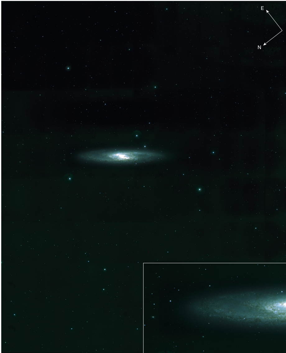
Figure 2. A VISTA image of the spiral galaxy NGC 253, located in the Sculptor Group, is shown. This true-colour image consists of co-added VIRCAM tiles in the J -band (red), narrowband 1.18 microns (green), and Z -band (blue). This 200-Megapixel image tile has a physical dimension of 1.21 \times 1.49 degrees, and impressively demonstrates VISTA's field of view (with the detector gaps filled in the tile). The long axis of the camera is aligned at position angle 52 degrees, and north is to the left and east is up. The inset shows a zoom of the north-eastern spiral arm of NGC 253. Complementary to the extremely large field of view attainable with VISTA, this image shows the good image quality achieved during the VISTA SV. Data processing and tile creation courtesy of CASU.

sky subtraction: the presence of an extended disc covering several detectors would prevent simple sky subtraction using images from different jitter exposures, because the disc is both bright and extended. Having adjacent pawprints made it possible to subtract the sky. This approach had an impact on the data reduction and identified the need for the definition of a sky template.