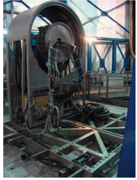
Figure 2. ISAAC, the silver round box in the upper part of the left image, is being taken out from its place at UT1. The right photo shows the co-rotator unit.