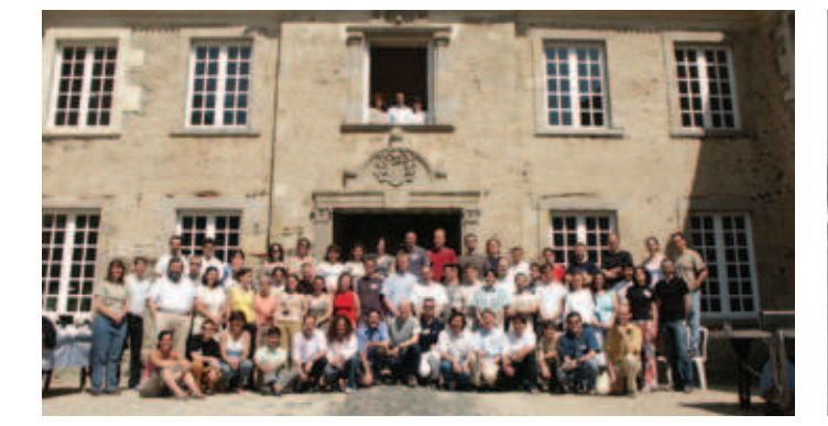
Figure 2. A selection of group photographs from the four VLTI summer schools at (clockwise): Les Houches, France, 2006; Porto, Portugal, 2007; Torun, Poland, 2007; and Keszthaly, Hungary, 2008.