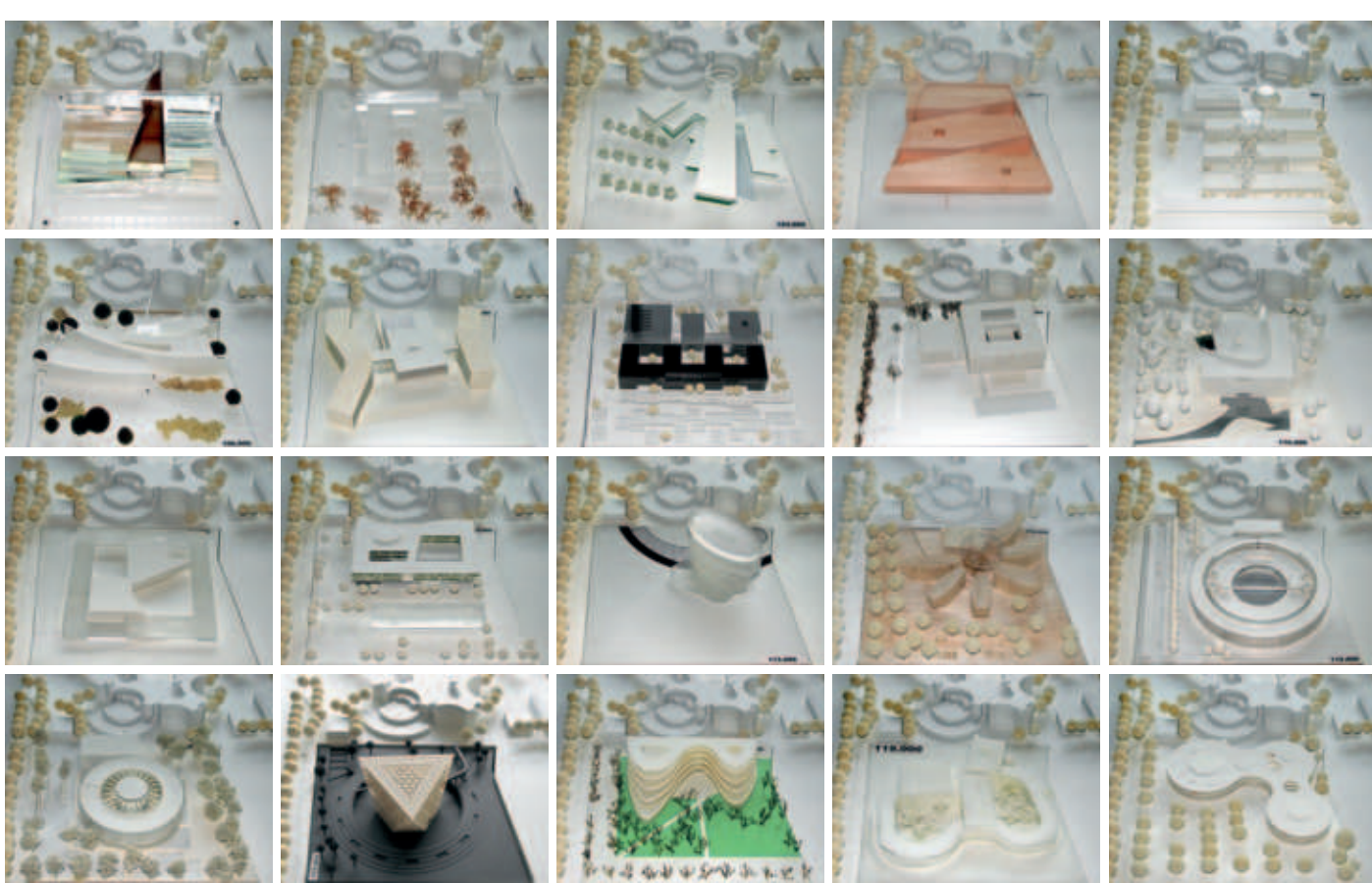
Figure 1. Montage of the 20 entries for the Architectural Competition for an extension to the ESO Headquarters.

The difficulties of working closely on joint projects with offices spread over an extended area were not just perceived. In 2007 a decision was made to try to improve the scientific atmosphere by bringing all faculty astronomers, fellows, students and science visitors together in the main building. Logistically this proved possible only for a short while and new