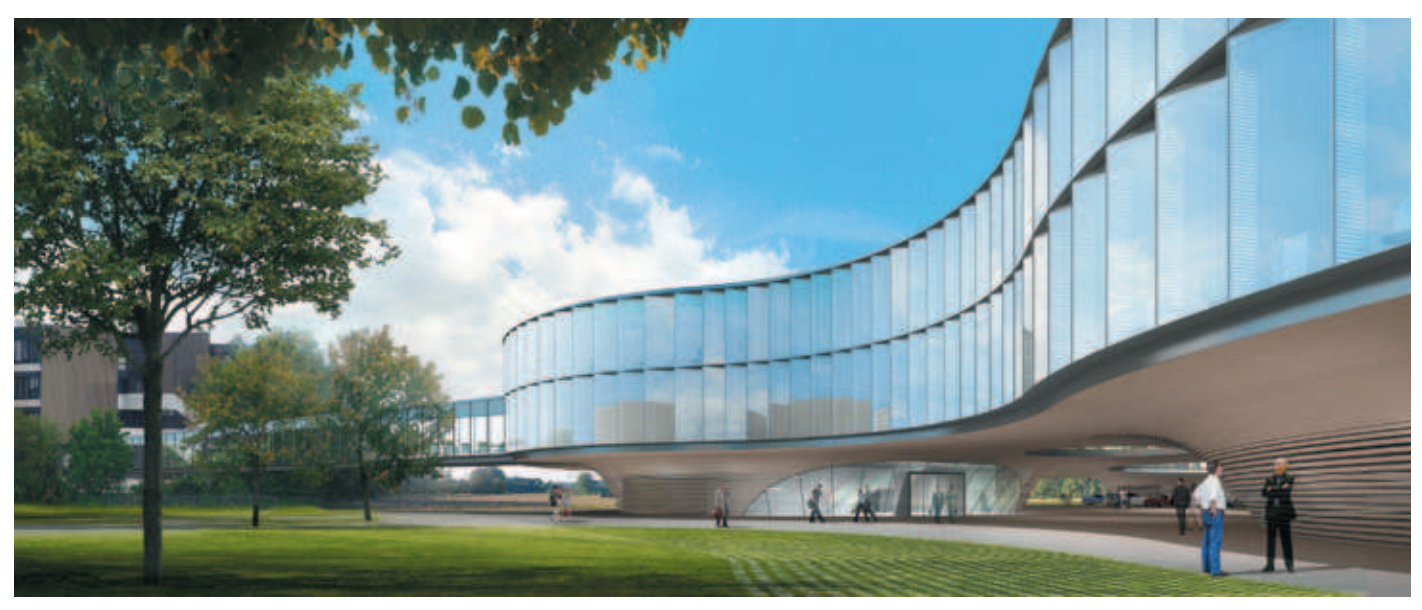
Figure 4. Side view of the Auer + Weber design for the ESO Headquarters extension from the southwest.

Spyromilio, J. et al., The Messenger, 133, 2 \,