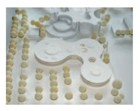
Figure 2. The three prize-winning architectural concepts for the Headquarters extension building in their revised form. Left: Koch and Partner, Germany; Centre: RISCO, Portugal; Right: Auer + Weber, Germany.

Initially it was planned to build the extension to the south of the current building