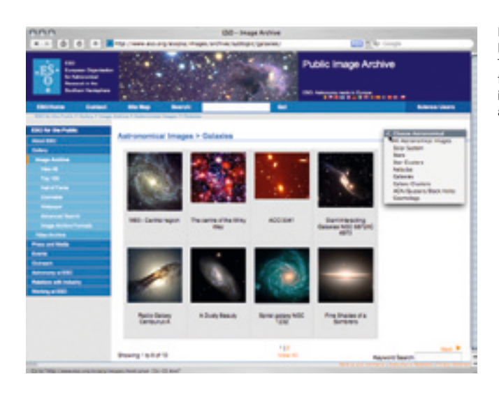
Figure 2: The new ESO Public Image Archive. The page shows the overview of galaxy images currently available

In the current implementation the ESO Web still consists of many single web pages that use a common style and navigation. In the near future it is planned to move to a database-based Content Management System. This will substantially improve maintainability of the site and will serve all web users with the most current information and a common Look and Feel