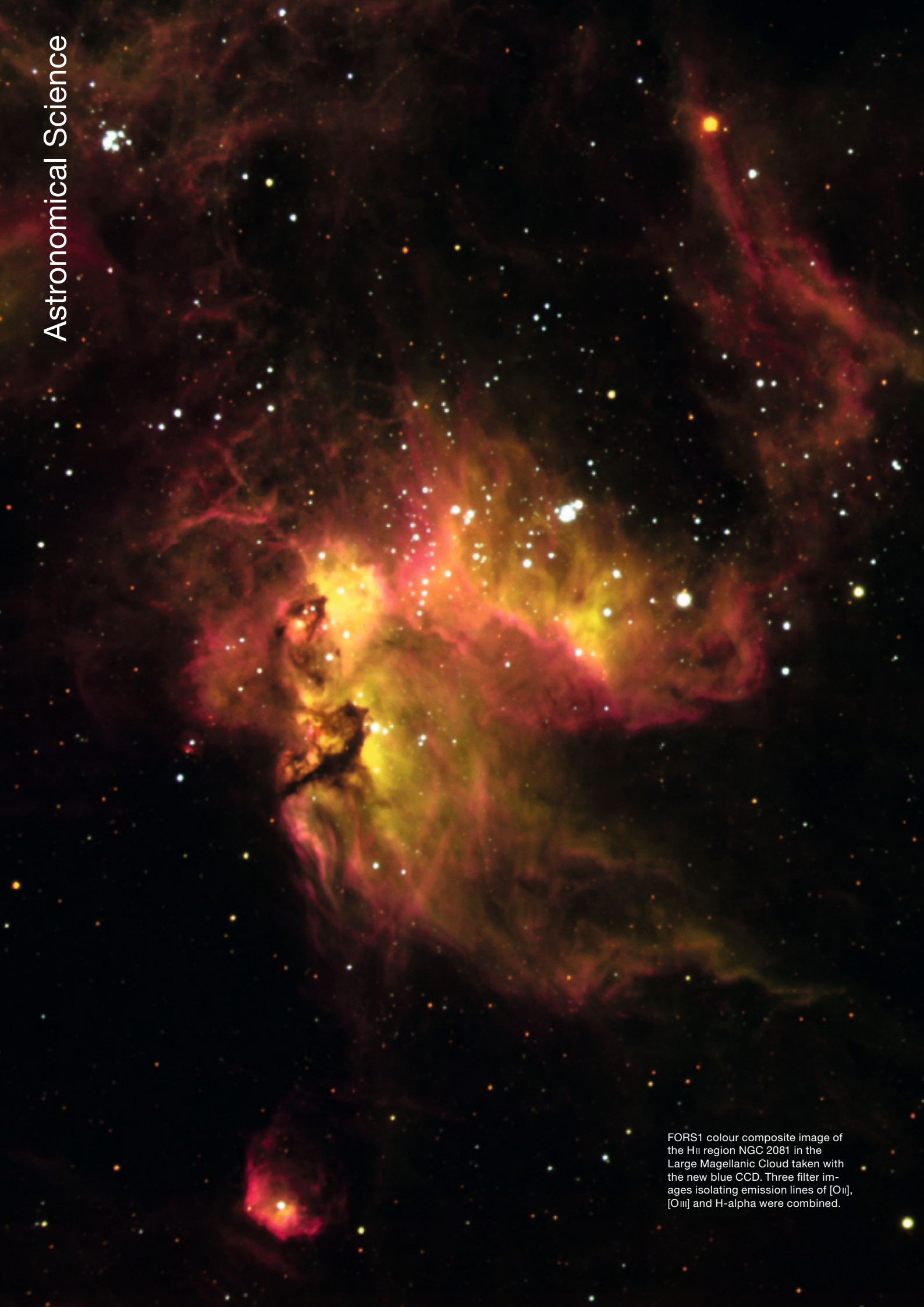
FORS1 colour composite image of the HII region NGC 2081 in the Large Magellanic Cloud taken with the new blue CCD. Three filter images isolating emission lines of [OII], [OIII] and H-alpha were combined.