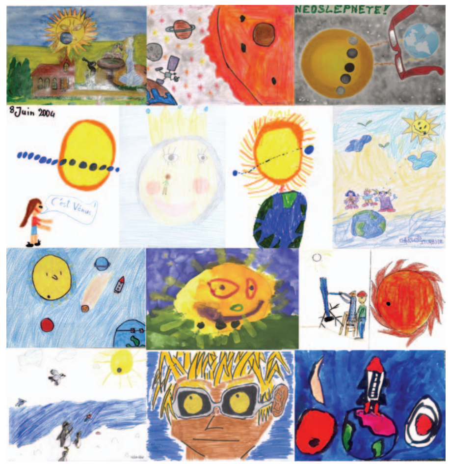
A random selection of drawings received by the VT-2004 programme.

In a next phase, a solution according to Delisle's or Halley's method will be attempt-