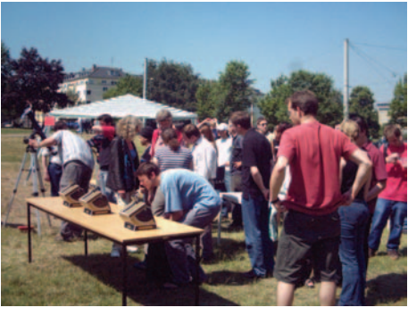
A few examples of Venus Transit public events all around the world: Reckange/Mess (Luxembourg), Karditsa (Greece), Wroclaw (Poland), Constantine (Algeria), Dublin (Ireland), and Cologne (Germany).

A CD-Rom containing relevant information about the event and an 11-min video of how to observe the event (prepared with the courtesy of Czech producers Herafilm and Czech TV with the collaboration of the Czech British High Commission and with the assistance of ESO and NASA) was distributed in all