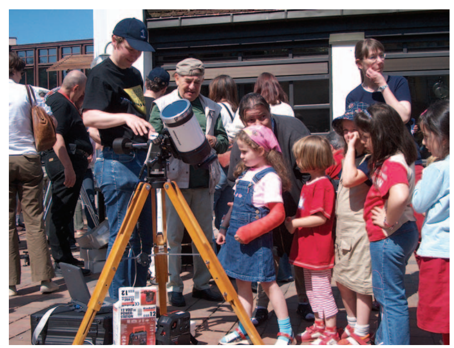
The ESO Amateur Astronomer group AGAPE was present on the central market place of Garching to share this unique event.

And for those who were as unlucky as astronomer Le Gentil in 1769 (who, having traversed a large portion of the globe, enduring all the perils of a long sea-voyage, and waiting for 8 years for the transit to occur, was unable to observe it because of a vexatious, black cloud that covered the Sun), or, more prosaically, for those who could not get to directly see the event for one reason or another, there was no need to despair. There