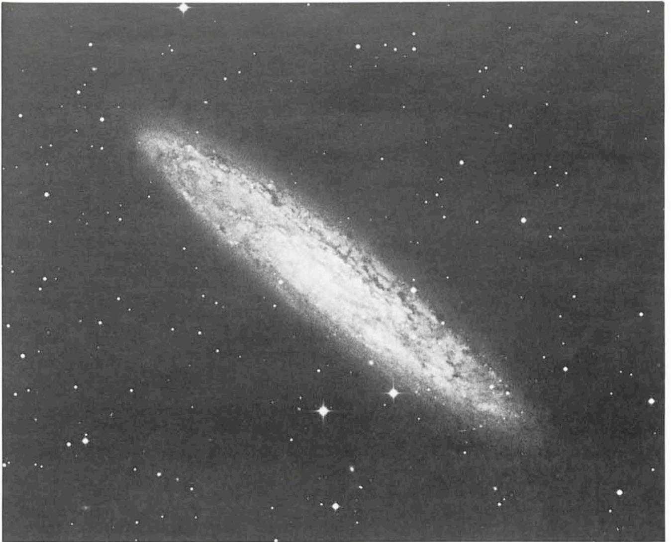
Fig. 1.—Photograph of NGC 253 with the ESO Schmidt telescope (IIa-O + GG385, 60 min).

It would be particularly interesting to conduct a spectrophotometric study of the ionized gas flowing out of the nucleus. Relative line intensities can provide the reddening—which is probably small since the gas is outside the equatorial plane—and the density of the gas. This information combined with a measure of the absolute intensity of one of the lines would allow to calculate the mass of the ionized gas escaping the nucleus. The temperature cannot be determined because [O III] 4363 is very weak; however, the mass of the emitting gas is only a slow function of the effective temperature T_e . Such an investigation is planned for the autumn of 1978 using the IDS scanner of the ESO 3.6 m telescope.