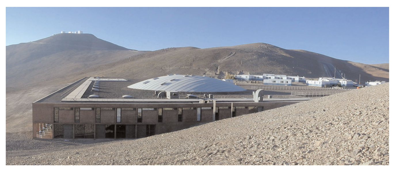
This photo shows the Residencia, looking towards west. The linear construction used to fill the natural depression of the ground in this area is evident. The 35-m central dome protrudes from the "filled-in" valley.

Ever since the construction of the ESO VLT at Paranal began in 1991, staff and visitors have resided in cramped containers in the "Base Camp". This is one of driest and most inhospitable areas in the Chilean