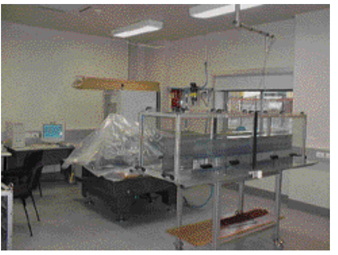
Figure 5: The VIMOS Storage Cabinet. 400 masks may be stored (100 per VIMOS quadrant).