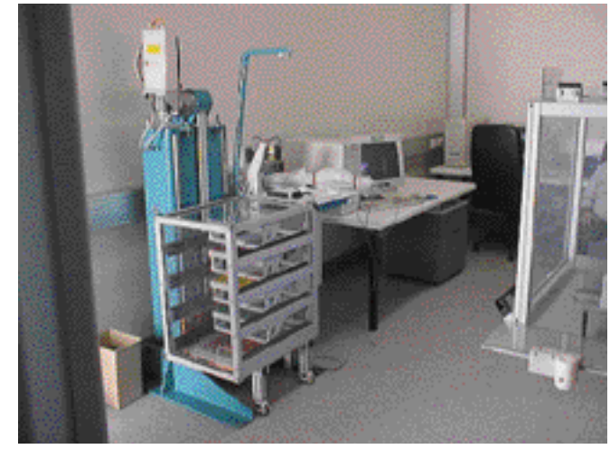
Figure 6: The Instrument Cabinet Robot. The four Instrument Cabinets corresponding to the four channels of VIMOS (or NIRMOS) are inserted in the stand.