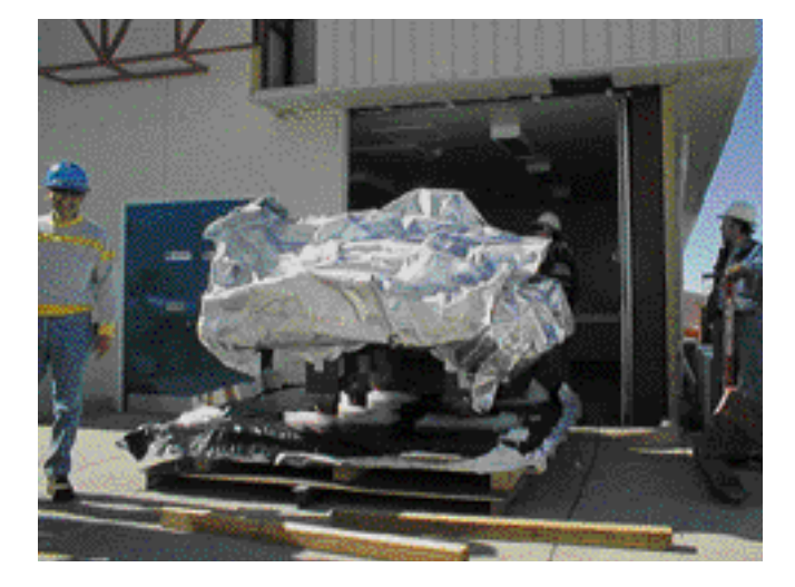
Figure 4: Moving the 2.5-ton Laser Table inside the MMU Laboratory. The wall had to be removed for this purpose.

We want to thank the Paranal Engineering and Facilities Departments