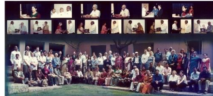
LISA VI February 2010 India Pune Inter-University Library and National Centre for Radio Astrophysics (NCRA) Library Centre for Astronomy and Astrophysics (IUCAA)