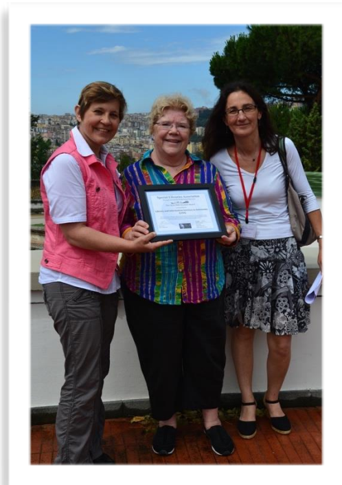
2014: Awarded at LISA VII, Naples, Italy

Acknowledgement from the Physics-Astronomy-Math (PAM) librarians' community of the Special Libraries Association (SLA)