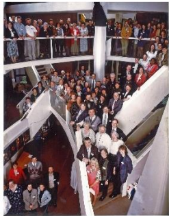
LISA II May 1995 Germany Garching bei München European Southern Observatory