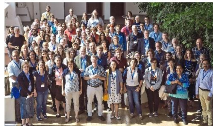
LISA VIII June 2017, France, Strasbourg Centre de Données Astronomiques de Strasbourg (CDS)