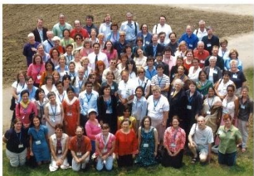
LISA V June 2006 Cambridge MA USA John G. Wombach Library, Harvard Smithsonian Center for Astrophysics and Libraries of the Massachusetts Institute of Technology