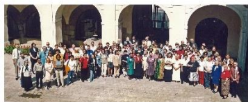
LISA IV July 2002 Czech Republic Prague Astronomical Institute Charles University