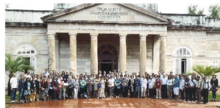
LISA VII June 2014, Italy, Naples Astronomical Obs. Capodimonte, INAF Library and INAF – SBAS Historical Archives Service in collaboration with University of Naples “Parthenope” and Science & Technology Dpt.