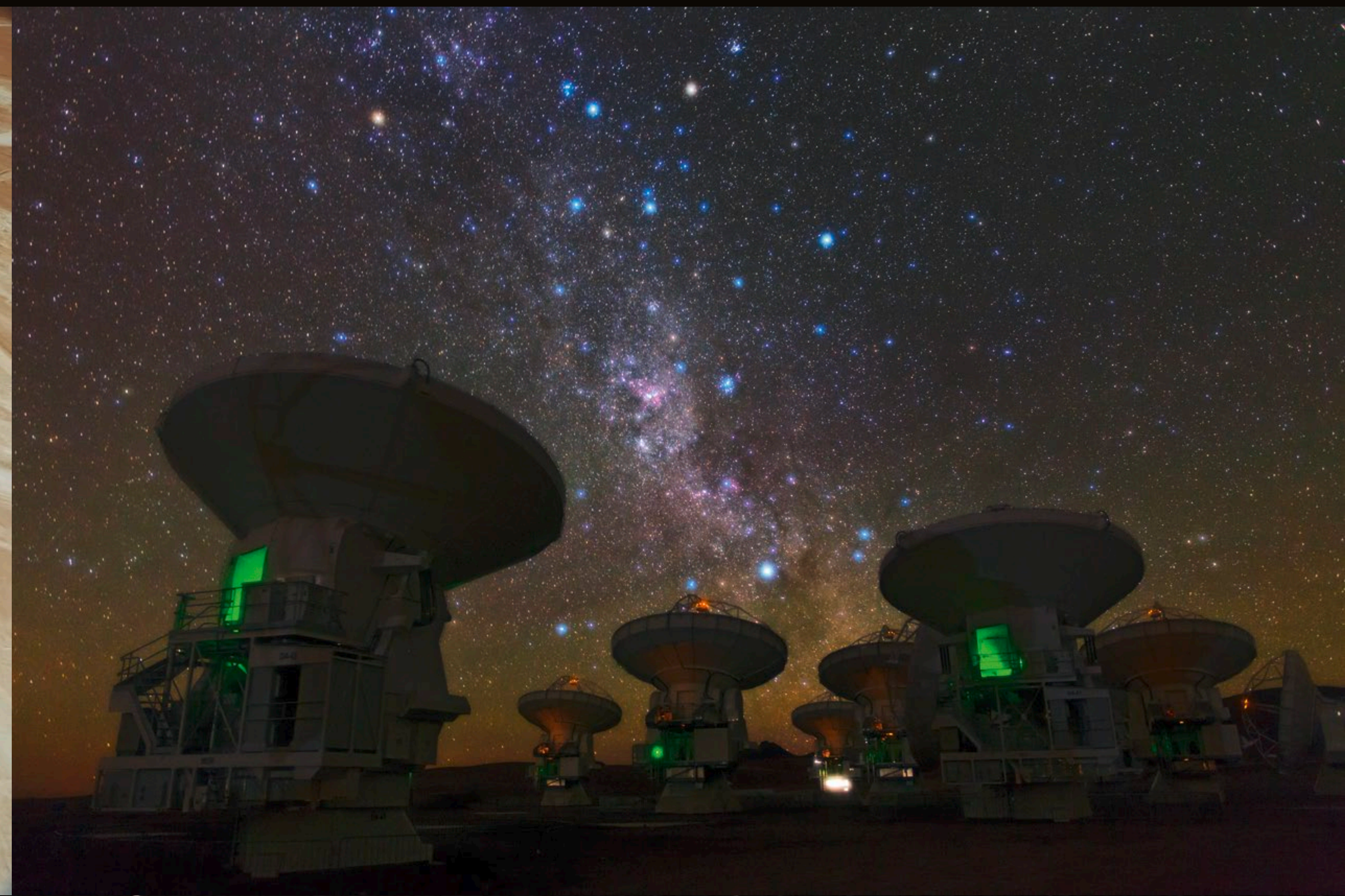
ALMA antennas at night on Chajnantor.