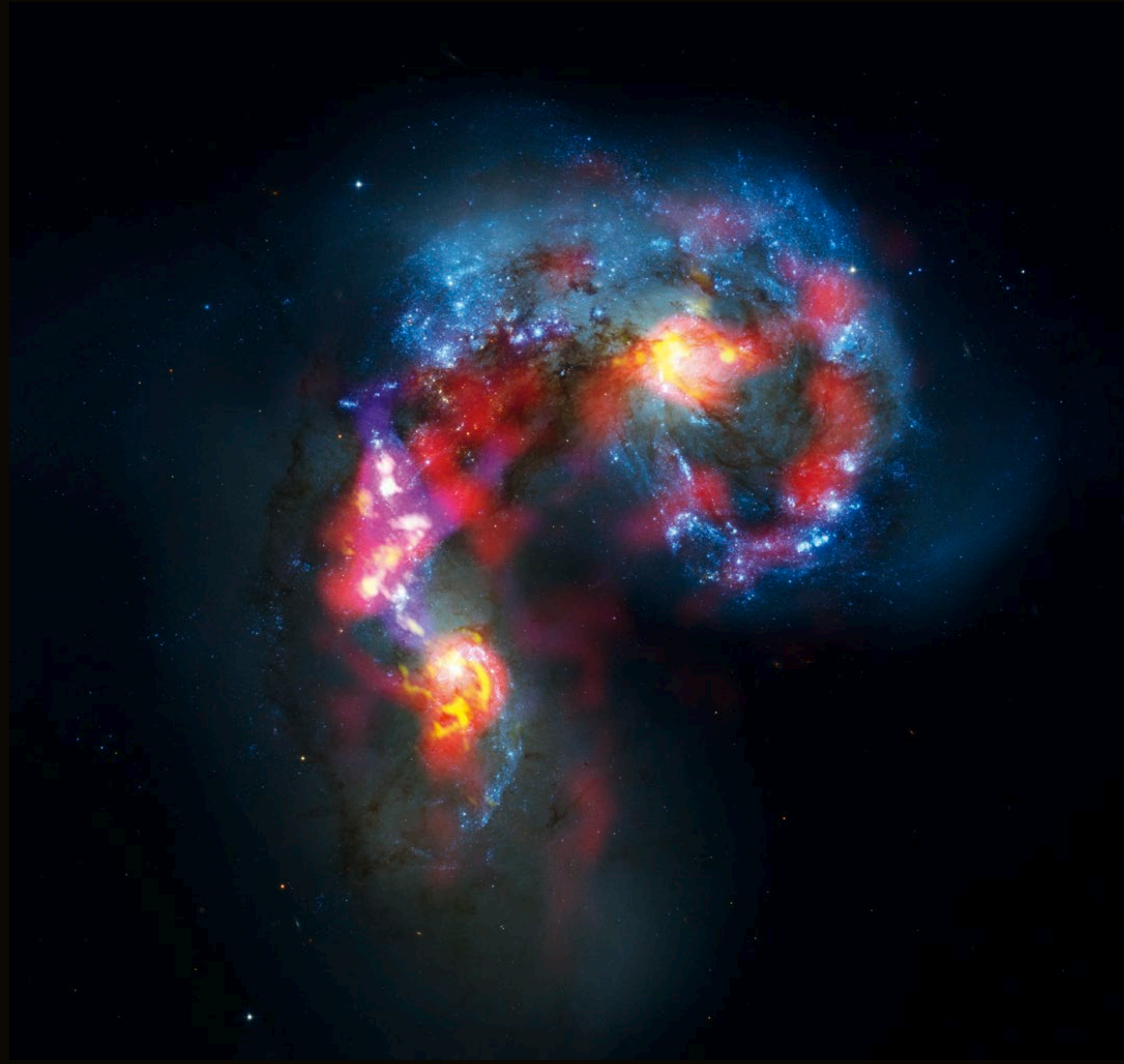
ALMA and Hubble observations of the Antennae Galaxies.