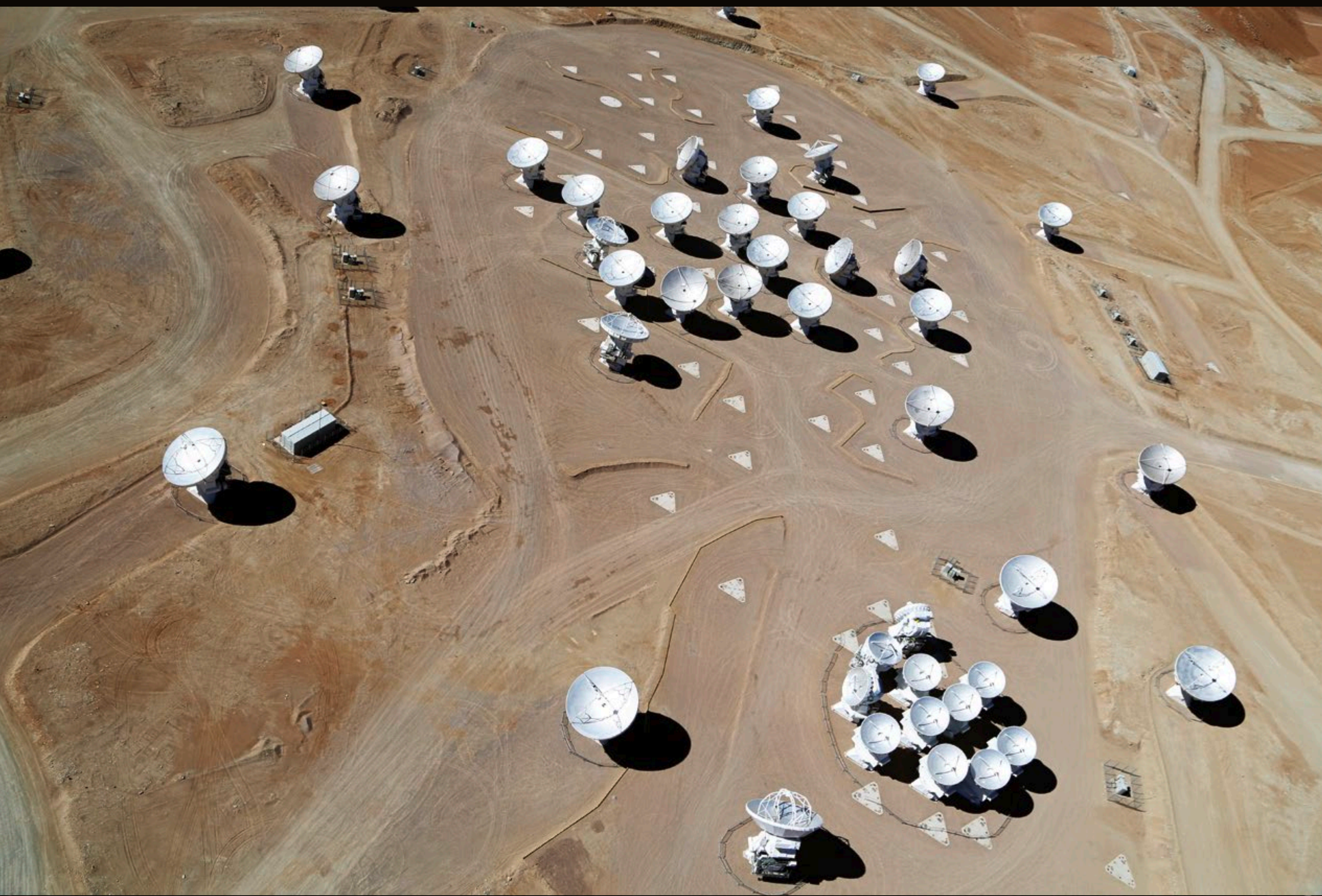
Aerial view of the ALMA array.

Astronomers also do millimetre- and submillimetre-wavelength astronomy at Chajnantor using the Atacama Pathfinder Experiment (APEX) telescope, a collaboration between the Max-Planck-Institut für Radioastronomie, Onsala Space Observatory and ESO. APEX is operated by ESO. The two telescopes are complementary; for example, APEX can find many targets across wide areas of sky, which ALMA will be able to study in great detail.