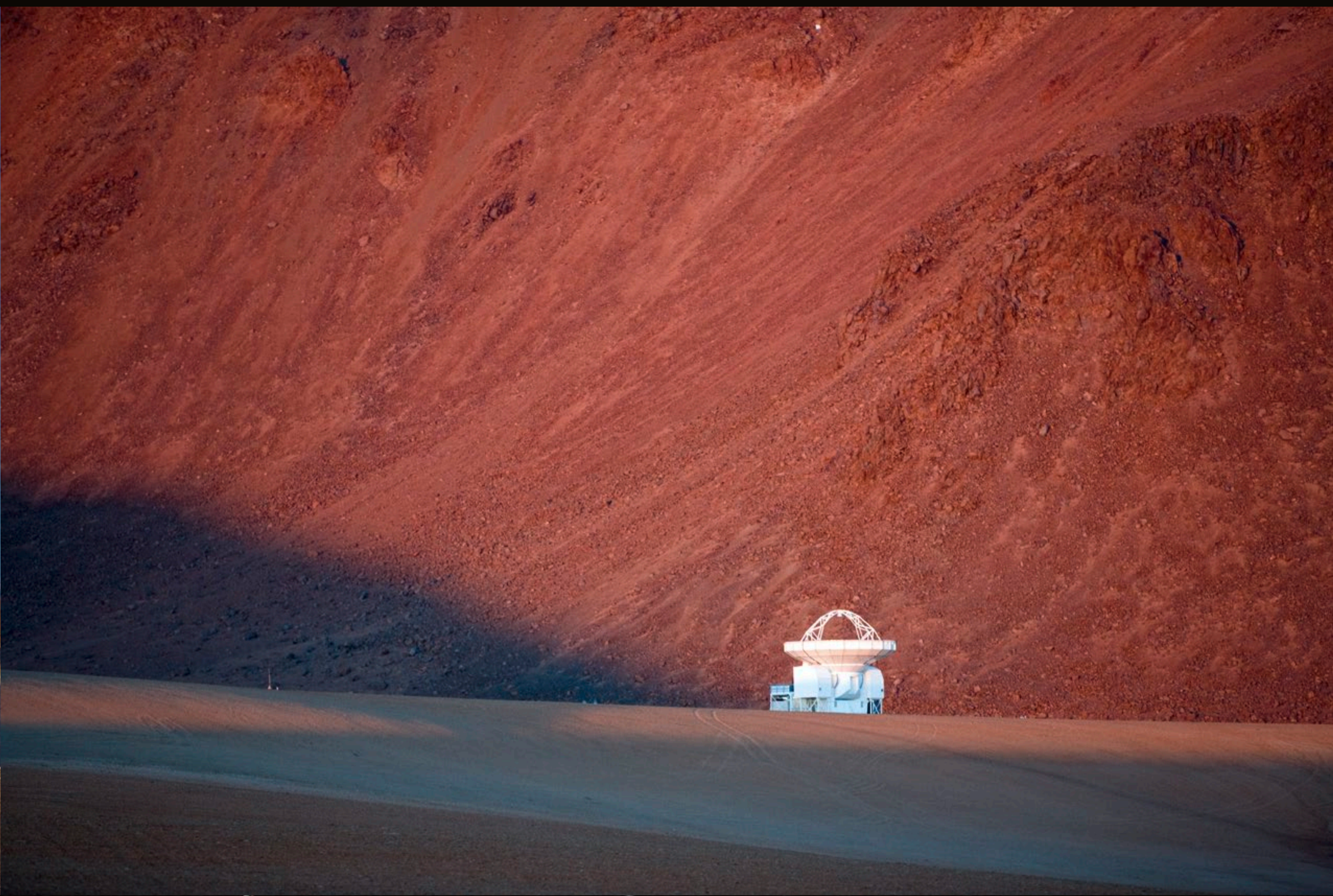
The APEX telescope is located at Chajnantor, on the same 5000-metre-high plateau as ALMA.