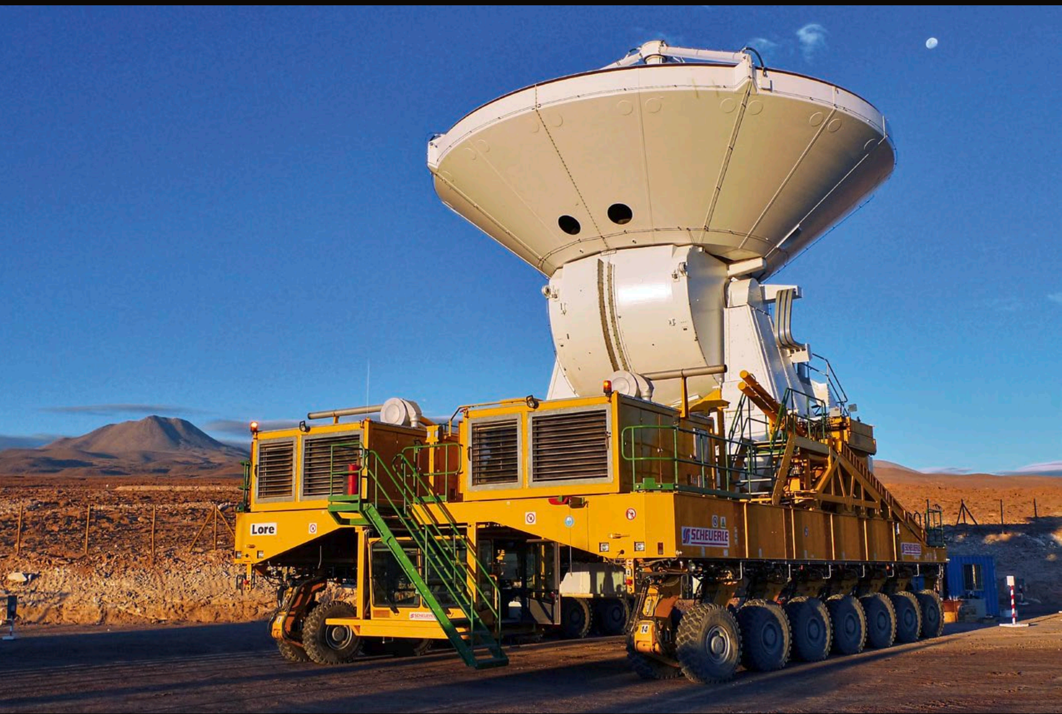
A European ALMA antenna takes a ride on one of the two enormous transporters.