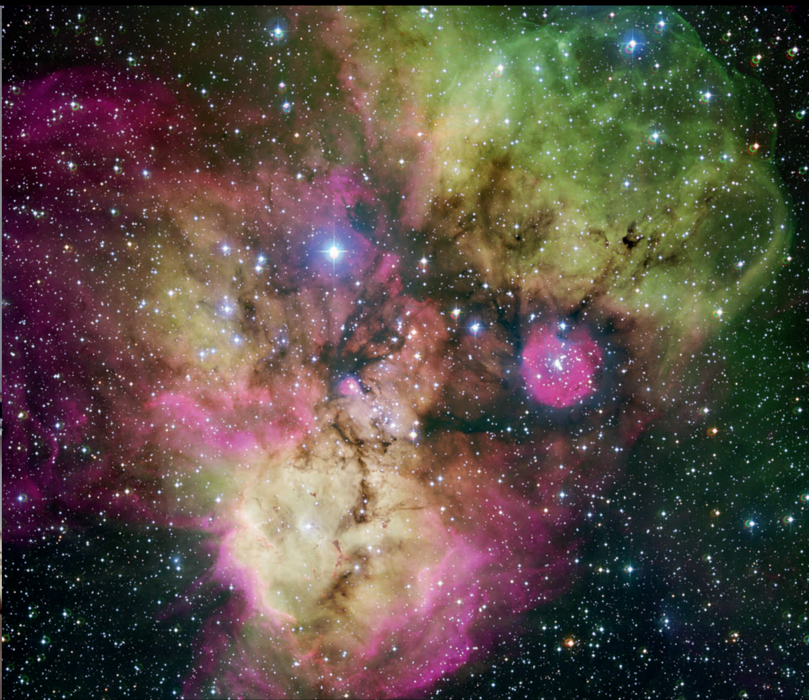
The star cluster NGC 2467 and surroundings.