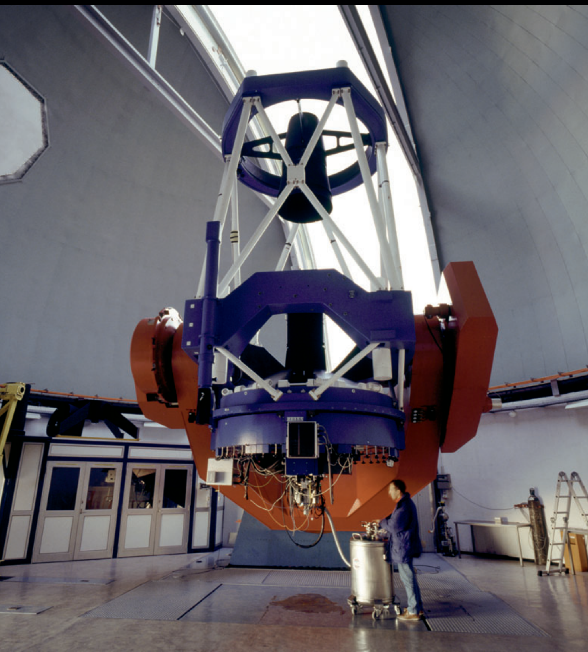
The MPG/ESO 2.2-metre telescope, built by Zeiss.

The telescope hosts three instruments: the 67-million-pixel Wide Field Imager, with a field of view as large as the full Moon, which has taken many amazing images of celestial objects; GROND, the gamma-ray burst optical/near-infrared detector, which chases the afterglows of the most powerful explosions in the Universe, known as gamma-ray bursts; and the high-resolution spectrograph, FEROS, which is used to make detailed studies of stars.